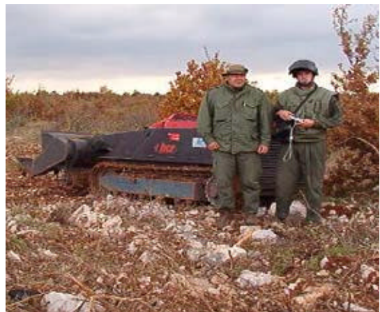
Figure 12. MV-3 Donated to CROMAC by Canada

Of the total CMAP funding in Croatia, $1.7m (CAD) was allocated to improve the capacity of CROMAC through multi-year institutional support projects managed by the UNDP. The implementation of five projects that began in November 2000 involved contributions ranging from $30,000 to $450,000 (CAD) for a two year period including; the UN/CROMAC transition programme ($300,000); development and delivery of training to managers ($30,000); automation and office equipment ($185,000); support to Survey/QA Departments ($450,000); and survey and verification projects ($300,000).