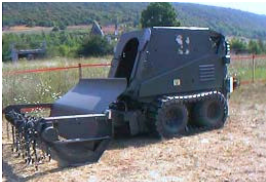
Figure 10. Bozena Donated by Canada.

UNMACC centralized assets. Ultimately, this permitted the MACC to greatly accelerate the final phase of clearance by supporting various organizations with specialized assets, increasing survey and verification capacity and facilitating innumerable small clearance tasks. This Canadian donation is cited as “the decisive factor in enabling the MACC to complete the objectives in 2001, in that it was the funding source for the majority of MACC centralized assets. In fact, the ability of the MACC to directly control the centralized assets through UNOPS contracts versus the situation that exists when the organizations are bilaterally funded was a significant contributing factor in the success that was achieved.” 53 It is also worth noting that part of the Canadian contribution was channeled through the ITF. Significantly, the matching funds were used to contract additional assets that enabled clearance of an additional 527,394 square metres and destroyed a total of 1,699 mines. This represents 28 percent of