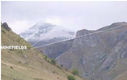
Figure 9. IDAC Minefield Sites in Mountainous Area Near Brod, Kosovo

The most serious problems involved leadership, technical standards and safety, and could be traced to one individual, the Deputy Project Manager. His unorthodox approach is cited as a factor in two 'preventable' accidents and the MACC's refusal to certify some of the project's clearance results. Interestingly, the UNMACC stressed that the difficulties created by this individual did not overshadow the excellent achievements and contributions of the project. While this did not make the deficiencies more palatable, it did offer some assurance that the overall project design and execution were sound, and underlined the likelihood that the results could