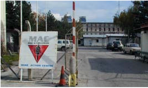
Figure 3. BHMIC Headquarters – Sarajevo