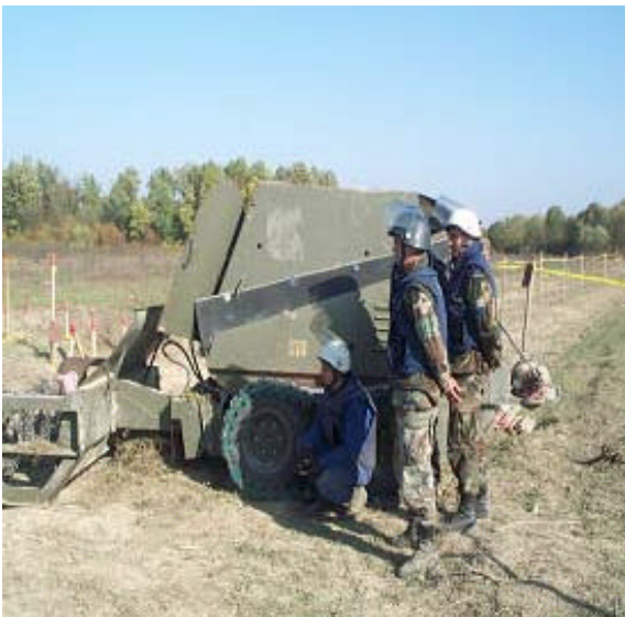
Figure 5. SFOR/EAF Bozena Donated by Canada

Canadian funding support contributed directly to the amount of area cleared through dedicated contributions to demining organizations such as NPA and APM as well as by the employment of assets made available by Canadian funding support such as MDD teams and mechanical clearance equipment. Indirect contributions include the funding of insurance premiums for EAF deminers operating under the auspices of SFOR and the donation of MDD teams, vehicles and mechanical clearance equipment to the EAF, the BiH Civil Protection Organization, APM and NPA. These contributions enabled demining operations to take place and the funding of insurance for the EAF deminers permitted SFOR to pressure the EAF to also undertake demining operations in accordance with the Dayton Peace Accord. In this project, CIDA contributions support demining operations that are carried out by demining teams from the entity armies of the Federation and the Republika Srpska. The mechanical clearance equipment and MDD teams are important centralized assets for rapid ground preparation, quality assurance and technical survey; however, some problems have been experienced by the EAF in the area of refresher training, maintenance and effective employment of these