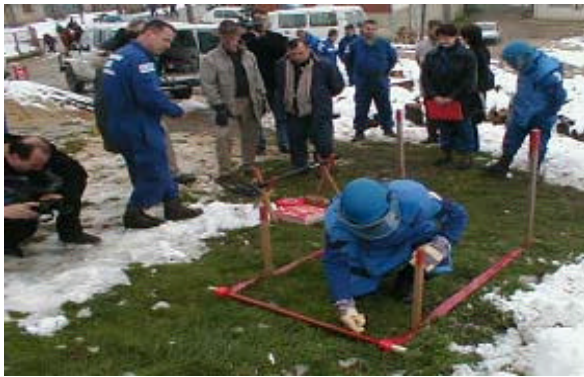
Figure 7. APM Mine Clearance - Sarajevo

Mine Clearance. In the area of demining, both the NPA and HI/APM projects were relatively problem-free in terms of implementation. Some management problems within APM caused concerns in 2001/02 but these were resolved without significant project disruption. In previous assessments, APM was criticized for being unable/unwilling to become more self-sufficient, however, since its partnership with HI terminated, APM has managed quite well as a self-