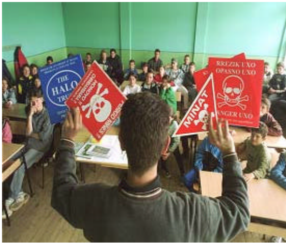
Figure 11. Primary School Mine Awareness Training, Sojeva, Kosovo

The project results are consistent with the stated goal of “strengthening the quality and scope of existing services for the disabled.” The project contributed to the well being of persons with disabilities at the community level. These people realized an improvement in their mental and physical health as well as a marked improvement in their overall quality of life. This was achieved through improving the skills of rehabilitation workers and increasing the scope of services available. The enhanced capacity of HANDIKOS enabled participation of the disabled in all levels of the development and implementation of activities promoting the rights of disabled persons. The profile of disability issues and public awareness has also been raised with input being provided by Queen’s ICACBR to assist in the drafting of a world Health Organization (WHO), Health Care Policy. The actual impact of this project on the disabled population, however, was very difficult to quantify. The bulk of information available was from project performance reports and previous interviews with project partners. The project has since terminated and no one was available to seek input from during the recent field mission. One should be able to assume, however, based on positive results of the Queen’s ICACBR project in Bosnia that equivalent results were achieved.