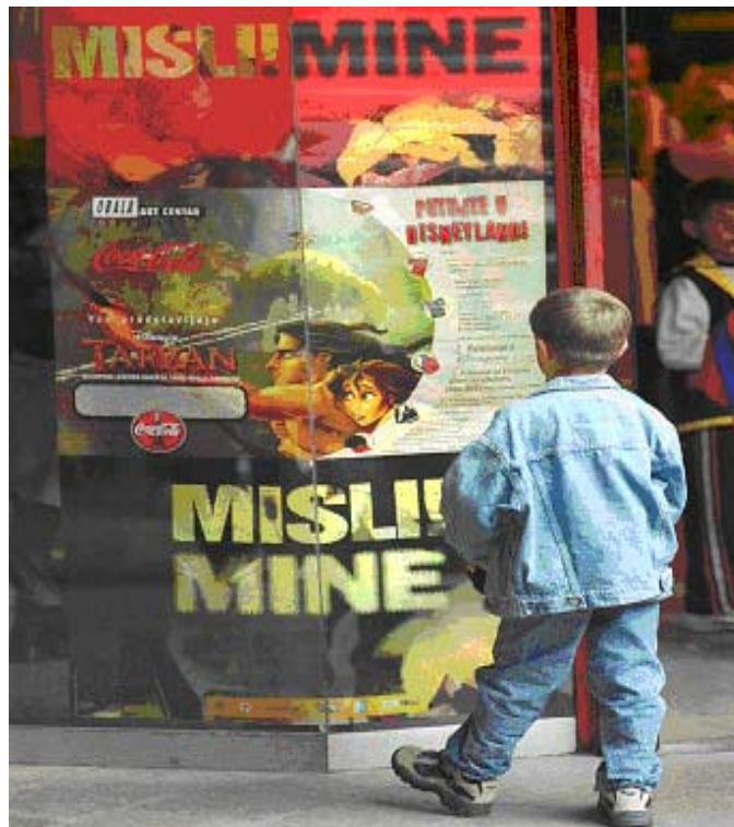
Figure 15. Mine Awareness – Saving Lives and Limbs

The CMAP was created in the context of a need for timely action and was expanded into Kosovo on an even tighter timeline. Thorough preparation and knowledgeable partners contributed to the success of the programme and minimized any risks involved. Annual monitoring and assessment missions, good project oversight and timely evaluation kept the programme on track. Several examples have been cited of proactive intervention by the programme officer, and CIDA post personnel played a valuable role in day-to-day surveillance and timely response. Notwithstanding this effort, some projects were challenging to manage at a distance and without a strong local partner. CIDC reporting was persistently poor and particularly in the case of the Croatia MDD centre, problems were not reported in a timely fashion. The same was true for the Kosovo demining contracts, which also had to be managed directly by CIDA. The majority of projects within the Balkans CMAP, however, were managed without difficulty, and good mechanisms existed to mitigate risk and ensure timely response to problems, needs or opportunities.