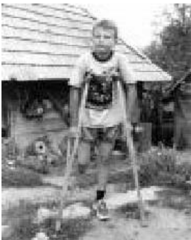
Figure 13. Mine Victim

The CMAP mine victim assistance project in Croatia funded a comprehensive victims survey and the completion of a "Mine Victim Needs Assessment Report." The Centre for Disaster Management and the Croatian Association of Mine Victims (CAMV) undertook these important projects. The survey was also expanded by CROMAC and CAMV into a complete database of mine victims that provides information about the current status of individual. The funding also provided for the conduct of physical and psychosocial workshops for mine victims, one for children and one for adults. These were held at a seaside hospital complex known as the Rovinj Centre where the wing of a building was renovated to accommodate the workshops. The workshop's curriculum has been refined and plans have been made to conduct four children's workshops in 2003, each of three-weeks duration and involving 20 candidates.