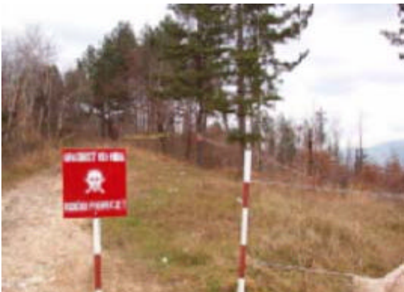
Figure 2. Outskirts of Sarajevo

UN protection areas were established and while some clearance took place, another brief round of fighting occurred in 1995 when the Croats conducted offensive military operations to restore their borders. During the initial conflict, the Croat forces consisted mostly of irregulars called into service with a small cadre of ex-JNA professionals. The Serbs also consisted of irregulars but were backed by professional military units of the JNA. Extensive mine laying was undertaken by each side in the conflict, however, a great number of mines were laid in haste by untrained personnel and record keeping was erratic at best. Some 14,000 records were initially retrieved reflecting a modest 132,000 AP and 79,408 AT mines, and an initial suspected mined area of roughly 4000 square kilometres. A large number of the records were discounted as unreliable and CROMAC now has 8,300 records on file. Obviously there are still many more mines than reflected in the records and this is complicated by concentrations of UXO, particularly in siege areas such as Vukovar. The current suspected mined area in Croatia is approximately 1,700 square kilometres and with an estimated 500,000 mines and an unknown amount of UXO.