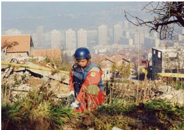
Figure 6. NPA Deminer Clearing Land Near Sarajevo

Regarding the future of the CIDC project, MDD training methodologies vary significantly and, in the short term, there will be a continuing need for refresher training and re-accreditation of