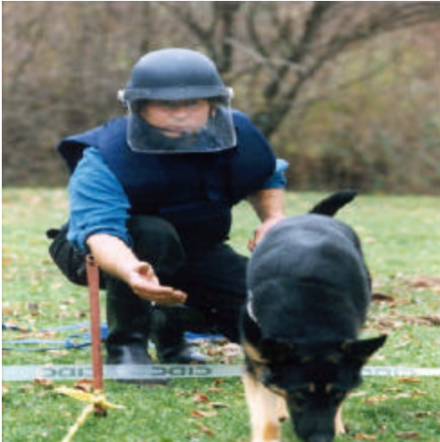
Figure 4. CIDC MDD Team (CIDA file photo).

The contributions varied from a one-year period to 21 months. The largest single contribution was of $1.43m (CAD) to SFOR. The other contributions were somewhat less, ranging from $400,000 to $840,000 (CAD) for the training of mine detection dogs (MDDs), the purchase and operation of mechanical mine clearance equipment, and the provision of specialized equipment for enhancing the capability of demining teams.