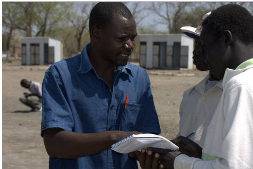
Consultation with communities during the LIS.

Although the LIS is a distinct project, its outputs are included as a part of the two regional logframes where the LIS is taking place (“Mine and ERW Survey and Clearance in North” and “Mine and ERW Survey and Clearance in the South”).