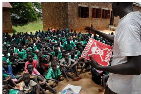
MRE session.