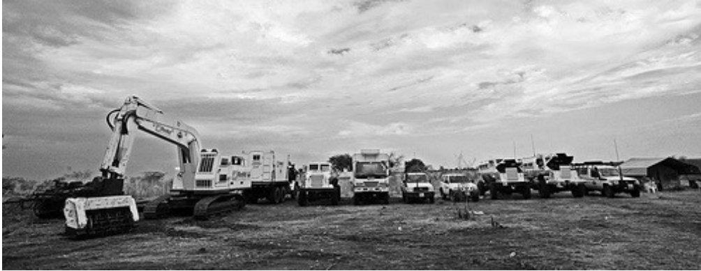
Demining assets in the south.