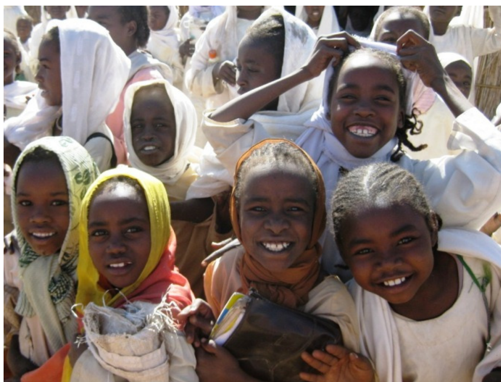
Children receive MRE in IDP camps in Darfur.