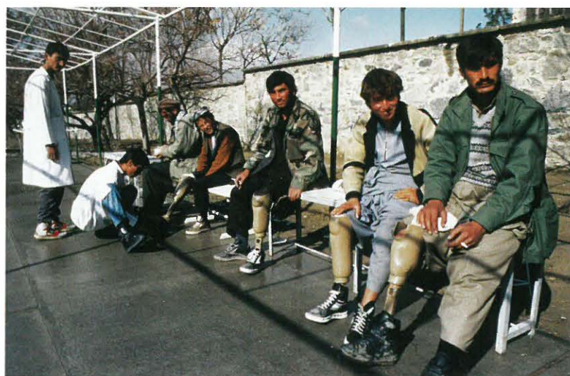
■ ICRC orthopedic center in Wazir Akilbar Khan.