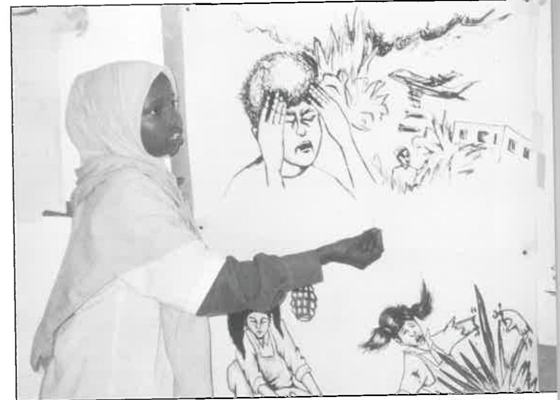
Rādda Barnen conducts peer education and landmine awareness: Yemen.

In the process of educating children about landmines and UXO, changing attitudes and transforming behavior presents a far more daunting task than simply increasing children's knowledge. To promote responsible attitudes among children, Save the Children tries to instill in them a sense of pride in the knowledge they have gained and encourages children to share information and model safe behavior for others. After completing the core curriculum, every child