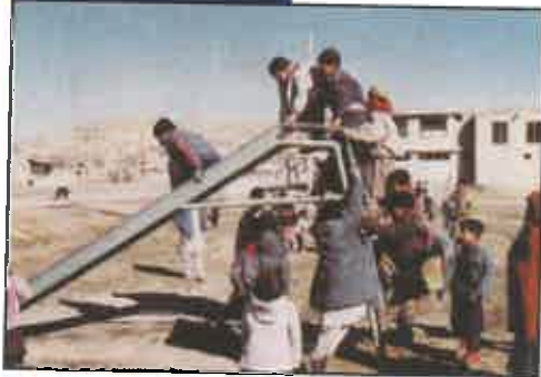
Children enjoy a mine-free playground in Afghanistan.

While much of the capacity building carried out by the Landmine Education Project has been for Save the Children's own staff, the sustainability of the project lies mainly within the trained volunteers. In the four prioritized districts where the Emergency Response Team works, nearly 200 male community