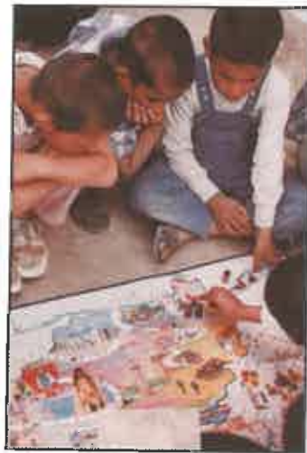
Games have been a very successful teaching tool for mine awareness education.

One of the most difficult concepts for the facilitators, teachers and volunteers has been the idea that children can play an active role in teaching and that they can learn through their interactions with each other. In all sessions, children are asked to discuss pictures and analyze situations together in small groups. Also, children who have already attended several sessions sometimes help facilitate small group activities for other children. At the end of every session, children are asked to transfer the messages they have learned to people in their homes and communities. Involving children in these ways can be a great