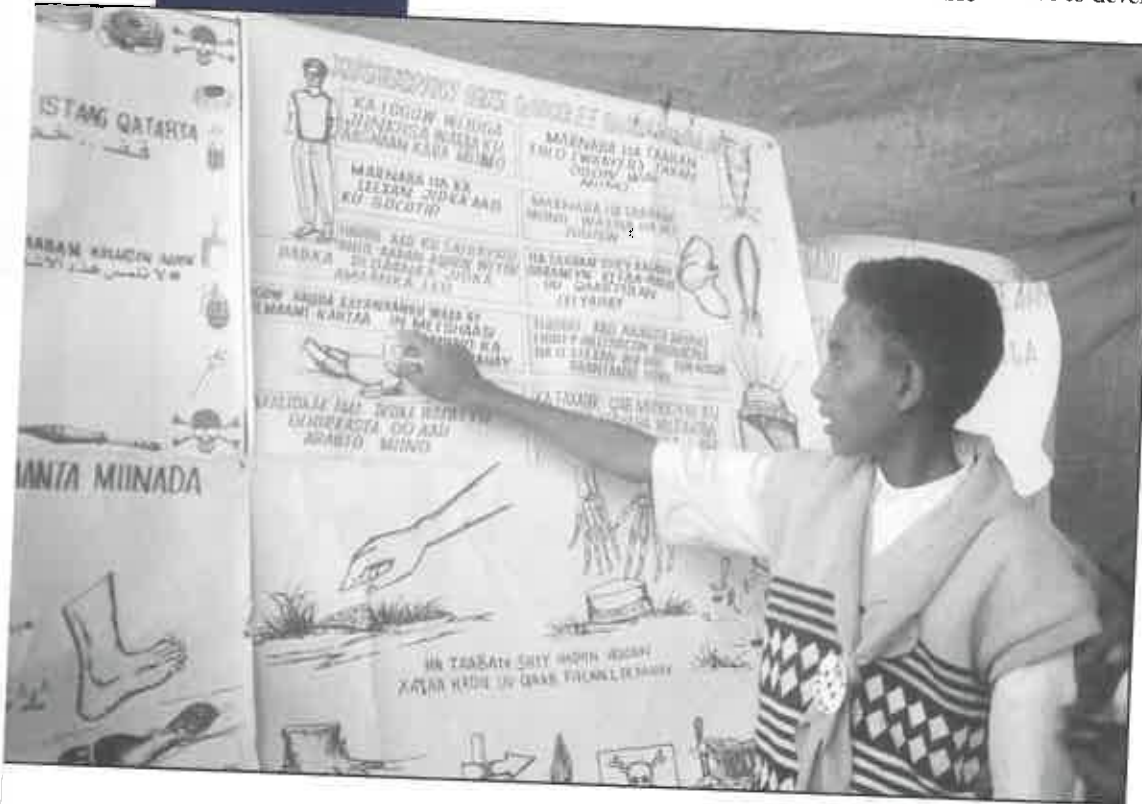
Teaching adolescents has been a challenge in mine awareness education.

tal stimulation and an opportunity to play. Parents and community members appreciate the unique educational opportunity that the program affords their children. Ironically, public school teachers and representatives of the Ministry of Education have been some of the most enthusiastic supporters of the methodology, many of them requesting additional training and inquiring how the philosophy could be applied to other subjects. In a country where war has virtually destroyed the educational system, the infu-