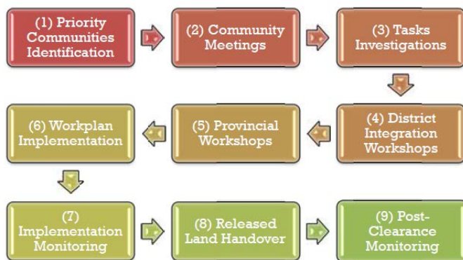
Chart 1: Mine Clearance Planning and Prioritisation Process in Cambodia 39

Cambodia has a bottom-up prioritisation process where the coordination of mine action planning is decentralised to provincial level PMACs and MAPUs. These bodies coordinate with affected communities, operators and development partners to develop annual land release plans. This involves gathering information from affected young and adult men and women in the communities about their preferences to determine how best to allocate available resources for specific land release tasks. This bottom-up approach was established in part to help mitigate some of the land-related problems that mine action organisations encountered in the 1990s and early 2000s.