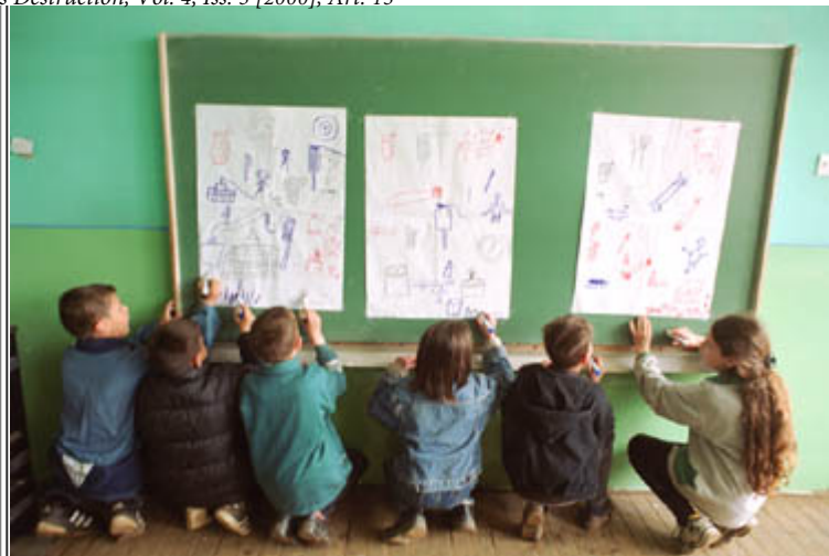
Pristia, Breznica - Elementry School: ICRC program to fight against the effects of mines on school children in Bosnia-Herzegovina.

By directing adults to complete surveys to ascertain the boundaries of mine-infested land, the community is participating in the mine awareness process. The trust adamantly asserts that "Children must not go looking for mines," rather the idea is that children communicate with community members to determine where mines are located; dates of explosions and the effects on the community; local knowledge of signs and warnings; and number of people who know the correct procedure to follow when encountering a mine. After completing these tasks, the children can then draw a map of the affected areas and indicate where the dangers are located and what warning signs are there presently. By permitting children to participate in this process, the children are likely to absorb the content of the program.