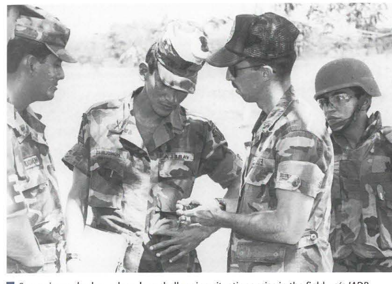
Supervisors play key roles when challenging situations arise in the field.

ragua, as rivers flooded washing out many bridges. As a result, some mines were carried off by floodwaters and deposited, in some instances, thousands of meters away, increasing the risk of accidents and forcing us to widen our search patterns. In addition, mines that were not displaced were covered with