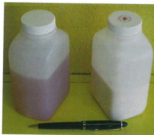
■ Figure 5 FIXOR liquid and FIXOR powder.

sides and detonated reliably. Given these findings, MREL concluded that FIXOR is an effective method for neutralizing landmines and UXO in place that integrates seamlessly with current B/P procedures. When compared to conventional explosives, FIXOR has significantly less hazards and less logistical requirements during transport and storage. These factors add to