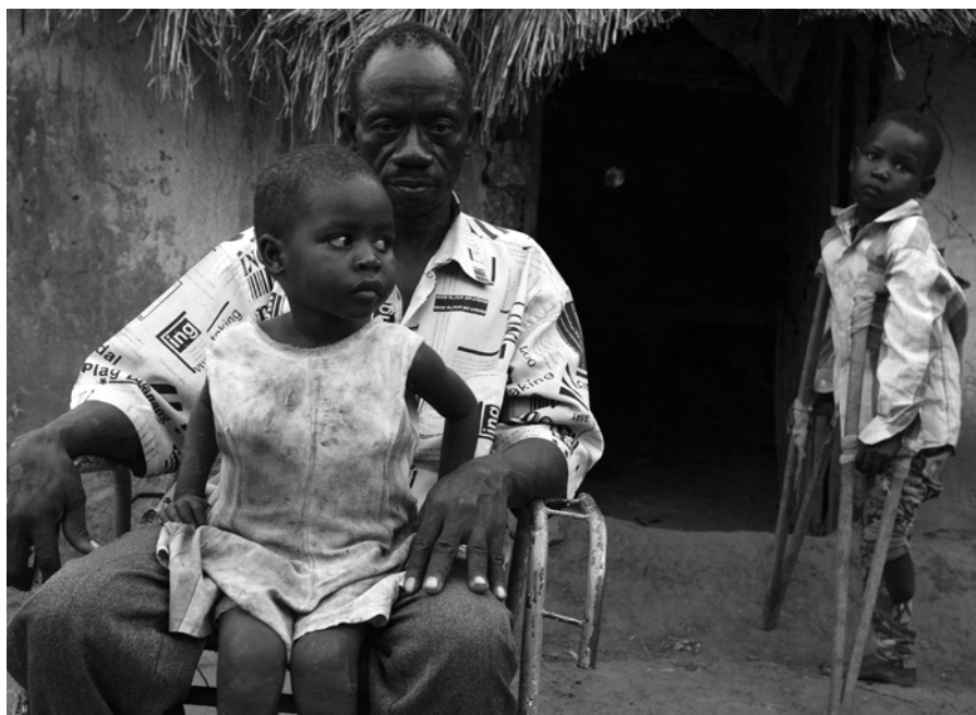
▲ Victim assistance programme for farmers in Sudan.

as clinics and schools), and the inclusion of survivors in vocational training and employment programmes.