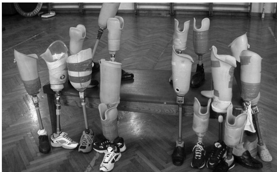
▲ Prosthetics ready to be used by landmine victims.

their efforts to ensure that mine action programmes have an equal impact on women, girls, boys and men and that all enjoy equal access to mine action as employees and beneficiaries, and as such, that both women and men have a decision-making role in mine action in their respective communities'. Consequently, it is crucial that good practices pertaining to gender are transferred equally to and fully embraced by national authorities. ■