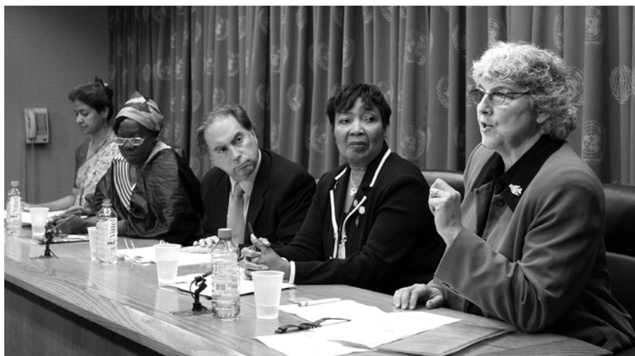
▲ Press conference to discuss implementation of Security Council Resolution 1325 (23 October 2002). From left to right: Vahida Nainar (India); Angeline Atyam (Uganda); Gabriel Valdés, Permanent Representative of Chile to the UN; Eddie Bernice Johnson (Moderator), Congresswoman of the United States; and Gila Sivirsky (Middle East).