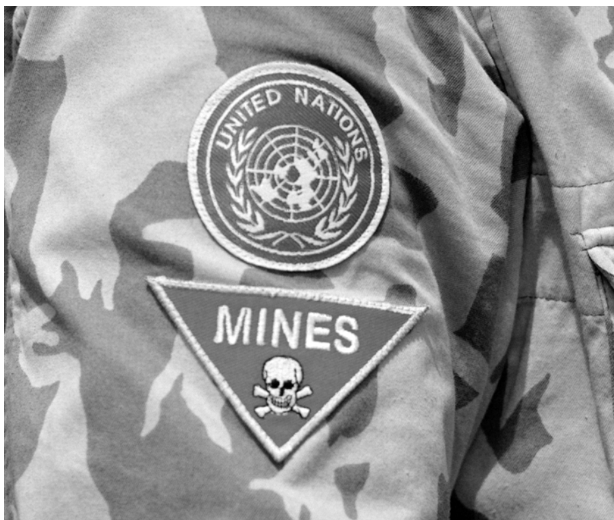
▲ United Nations and mines logos, United Nations Mission in Eritrea and Ethiopia (UNMEE).

mine action programmes, has enhanced their visibility, thus demonstrating the importance of their inclusion. Female deminers, surveyors and educators employed in the mine action sector have become role models for their female counterparts in villages, cities and rural areas, and have proved to be a robust and dependable resource.