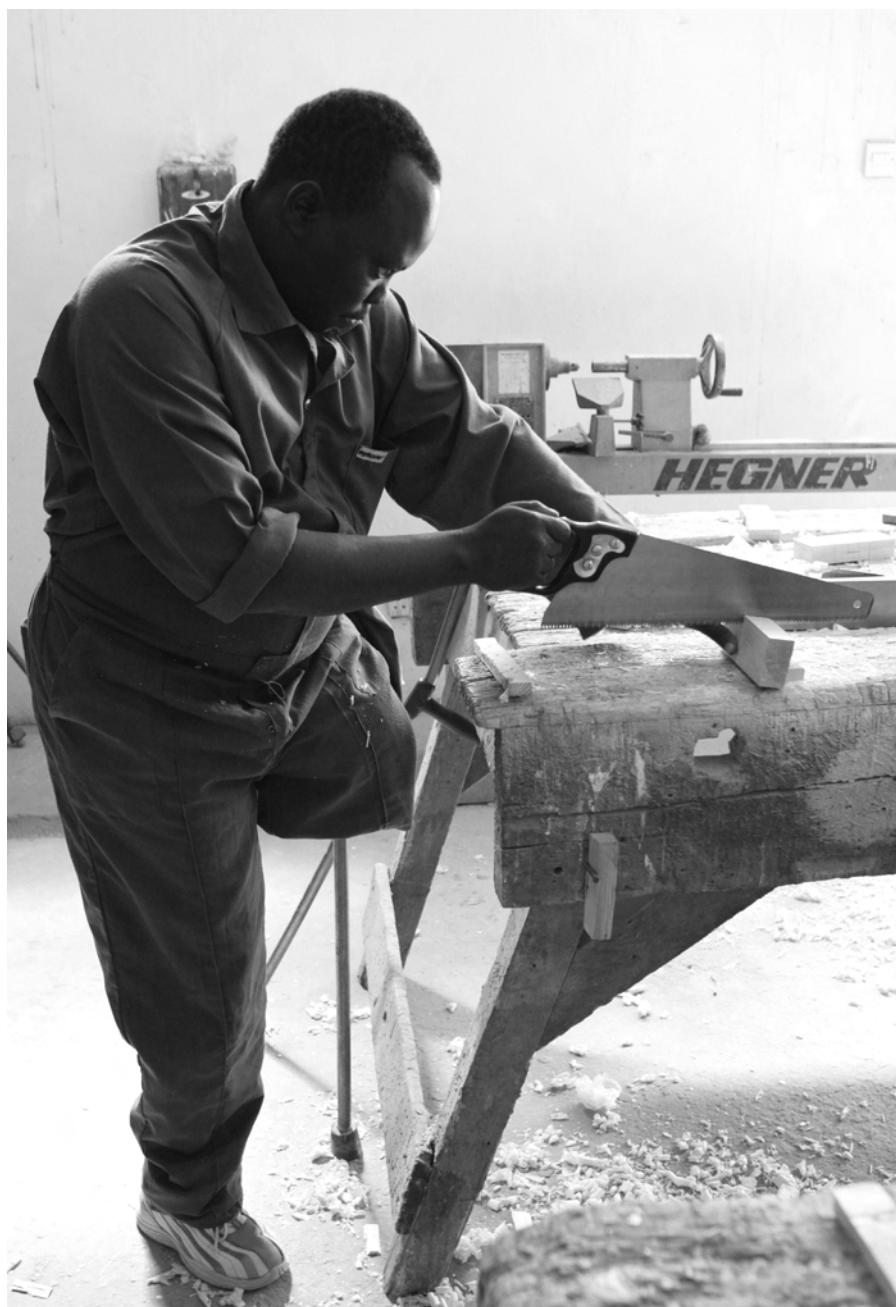
▲ Victim assistance programme in Sudan, 2007.