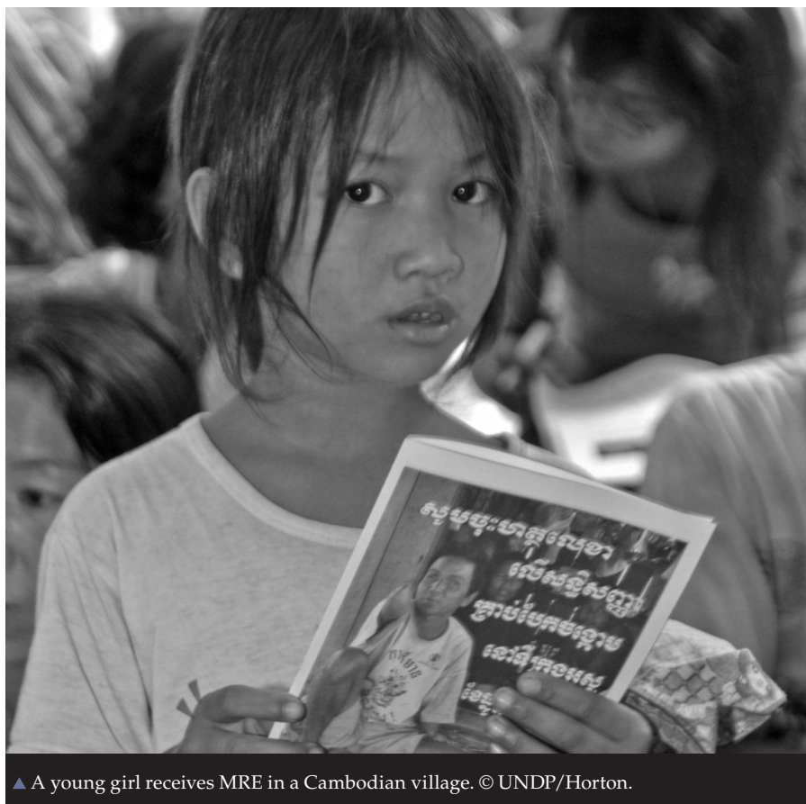
▲ A young girl receives MRE in a Cambodian village.

programmes take into account the special needs of women and girls’. 29 It urges all actors to increase the participation of women and to incorporate gender 30 perspectives in all UN peace and security initiatives. Promoting gender equality and empowering women is also one of the Millennium Development Goals.