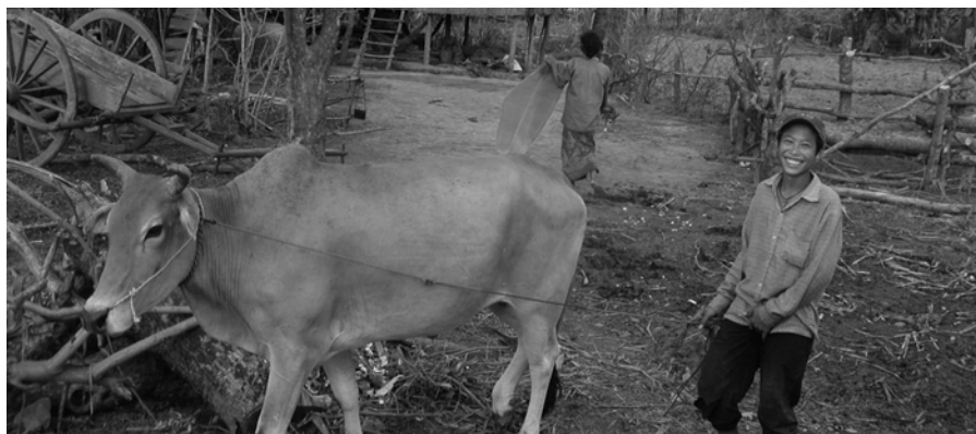
▲ Farmer herds livestock received through victim assistance.

The recommendations included in the guidelines reflect good practice in specific contexts and, while indicative of considerations to be borne in mind by mine action programme personnel, will not be directly applicable in all circumstances. The guidelines should be adapted to the local context.