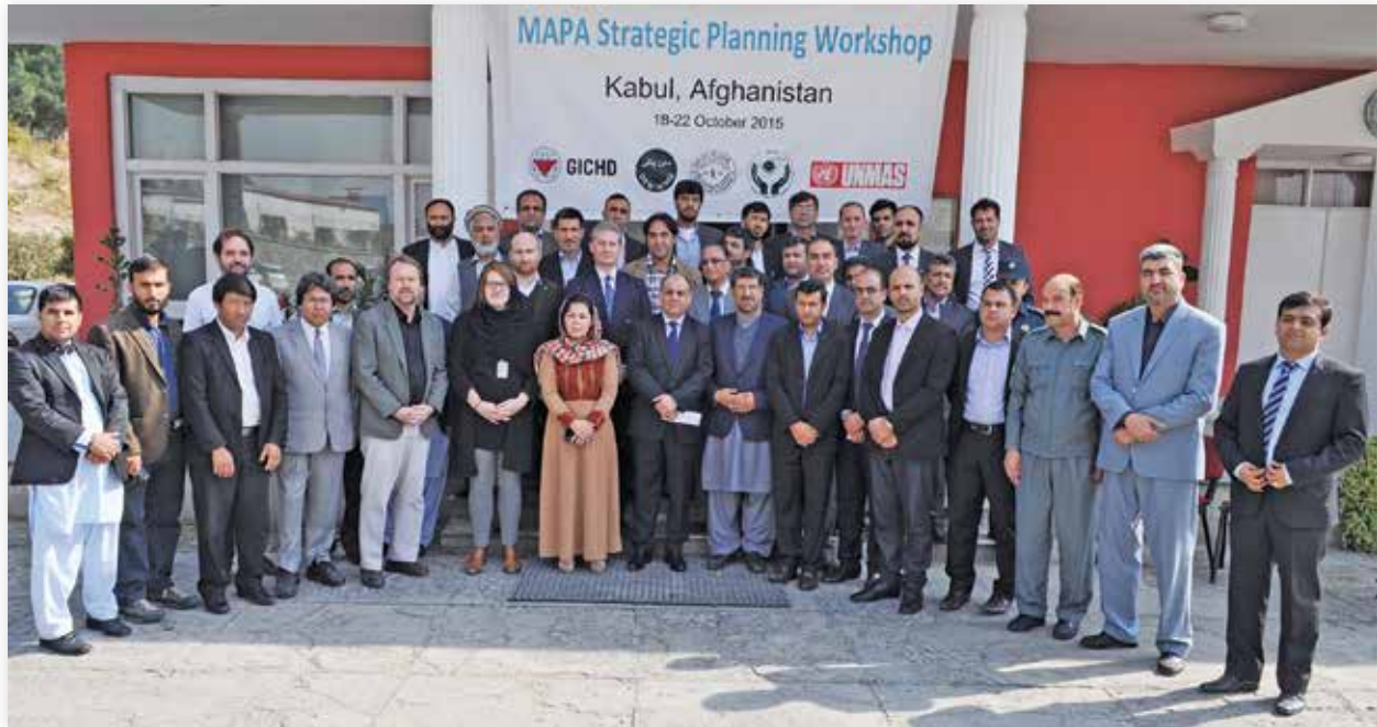
The end of the first workshop, 22 October 2015.

that all gender and diversity groups participate in and benefit from the work of MAPA and that MAPA benefits from the insight and participation of gender and diverse groups in all aspects of its work.