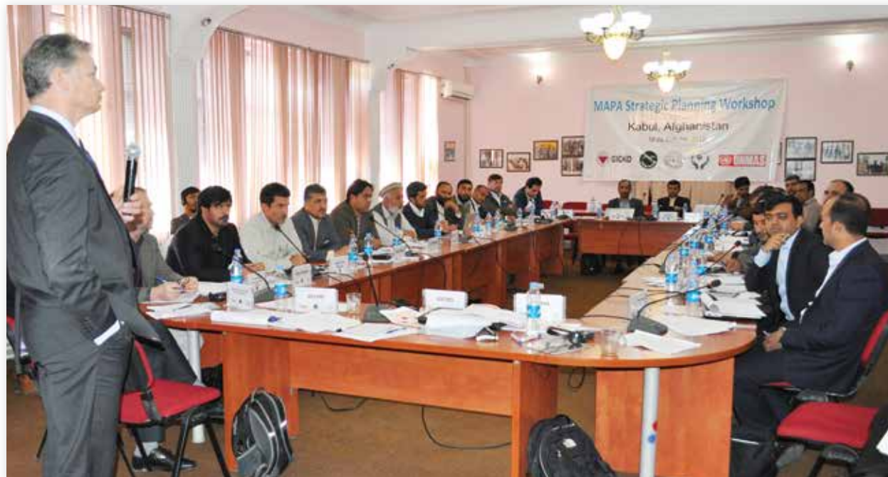
The National Mine Action Strategic Plan (NMAPS) workshop, 18 October 2015.

The Mine Action Programme of Afghanistan (MAPA) has surveyed and cleared almost 80 percent of all known mine/ERW contamination throughout the country. MAPA's main functions are coordinating, planning and setting priorities, information management, mobilizing resources, and ensuring quality of mine action services, advocacy and communication. The Directorate of Mine Action Coordination (DMAC), which works under the Afghanistan National Disaster Management Authority, partners and coordinates with the United Nations Mine Action Centre for Afghanistan (UNMACA) under the United Nations Mine Action Service (UNMAS).