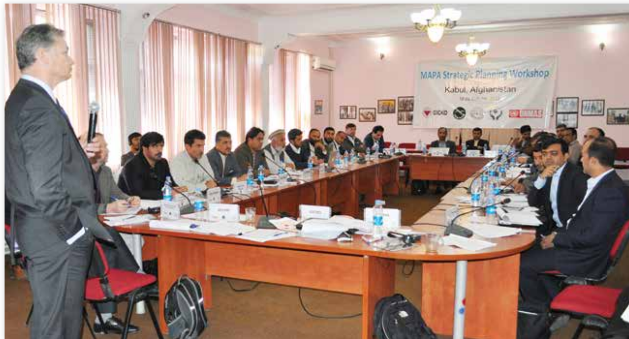
The National Mine Action Strategic Plan (NMA SP) workshop, 18 October 2015.

The Mine Action Programme of Afghanistan (MAPA) has surveyed and cleared almost 80 percent of all known mine/ERW contamination throughout the country. MAPA's main functions are coordinating, planning and setting priorities, information management, mobilizing resources, and ensuring quality of mine action services, advocacy and communication. The Directorate of Mine Action Coordination (DMAC), which works under the Afghanistan National Disaster Management Authority, partners and coordinates with the United Nations Mine Action Centre for Afghanistan (UNMACA) under the United Nations Mine Action Service (UNMAS).