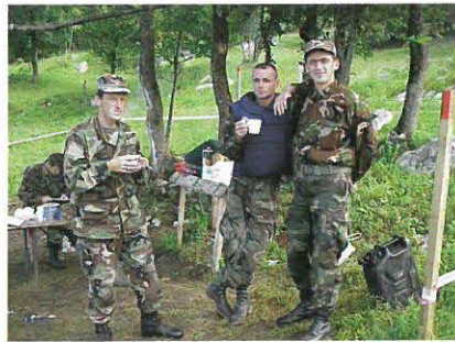
■ B5SW1 Team medic and two partners in crime, relax in the admin area.

Bihac for 1,200 plus days against overwhelming forces. They held their own for that entire battle through the good and the bad times. Even though the rest of the town has tried to get back to life after eight years of brutal conflict, these men are still fighting that same battle on the ground they had been on in July of 1995 in Cekrilje. The Serbs may have been defeated, but the mines are still standing awaiting their victims with patience and steadfast, ruthless dedication. But as terrible as these mines are, they do nothing to dampen the efforts of the sterling, professional character of the deminers of 5 Korpusa.