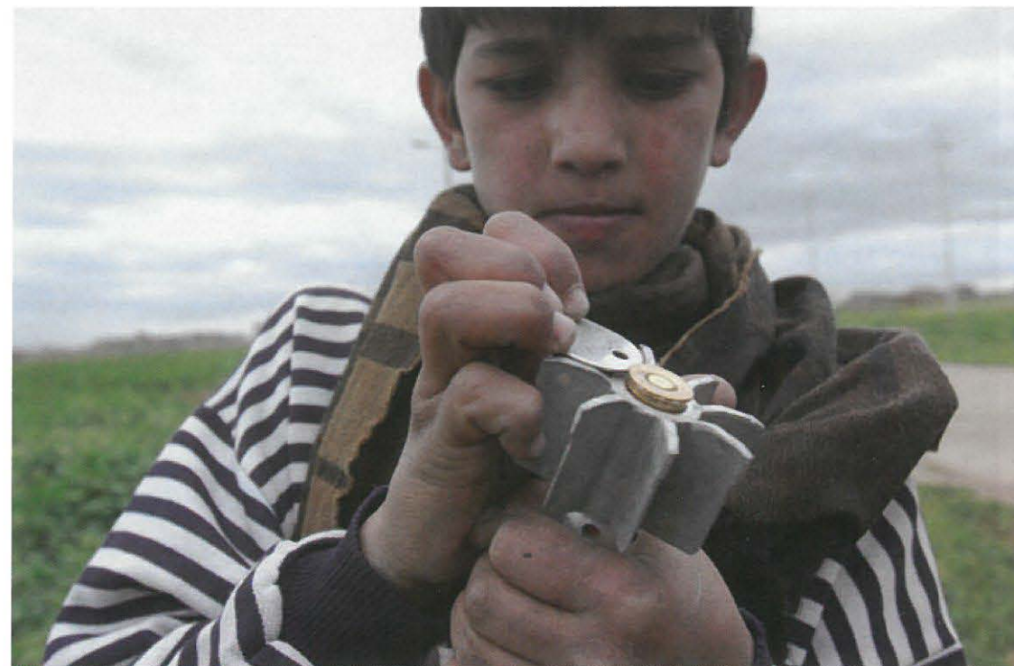
Even with effective mine action campaigns, children will still be curious about UXO.

From the beginning of March up to the end of May, MAG achieved the following results: