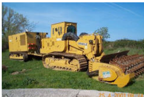
Oracle heavy machine.

The Center will enable donors, manufacturers and end-users to test and develop demining machines and mine/UXO detection methods and techniques on its own site. In collaboration with CROMAC, the Center will conduct field tests and operative evaluations of new technologies and methods for minefield detection, mine-suspected area reduction and mine/UXO detection in real minefields. It will also develop and improve mine information systems (MISs) and geographic information systems (GISs), integrate advanced decision-making support methods, provide situation overviews and increase spatial data quality.