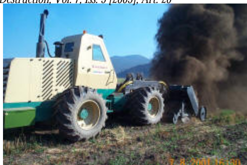
Samson medium-sized machine.

The Center will also train work site managers, team leaders, demining project development staff and quality assurance (QA) staff for CROMAC, demining companies and non-governmental organizations (NGOs) inside and outside of Croatia, in cooperation with similar institutions all over the world. Through a special training program, the Center will prepare mine action managers for missions in foreign countries.