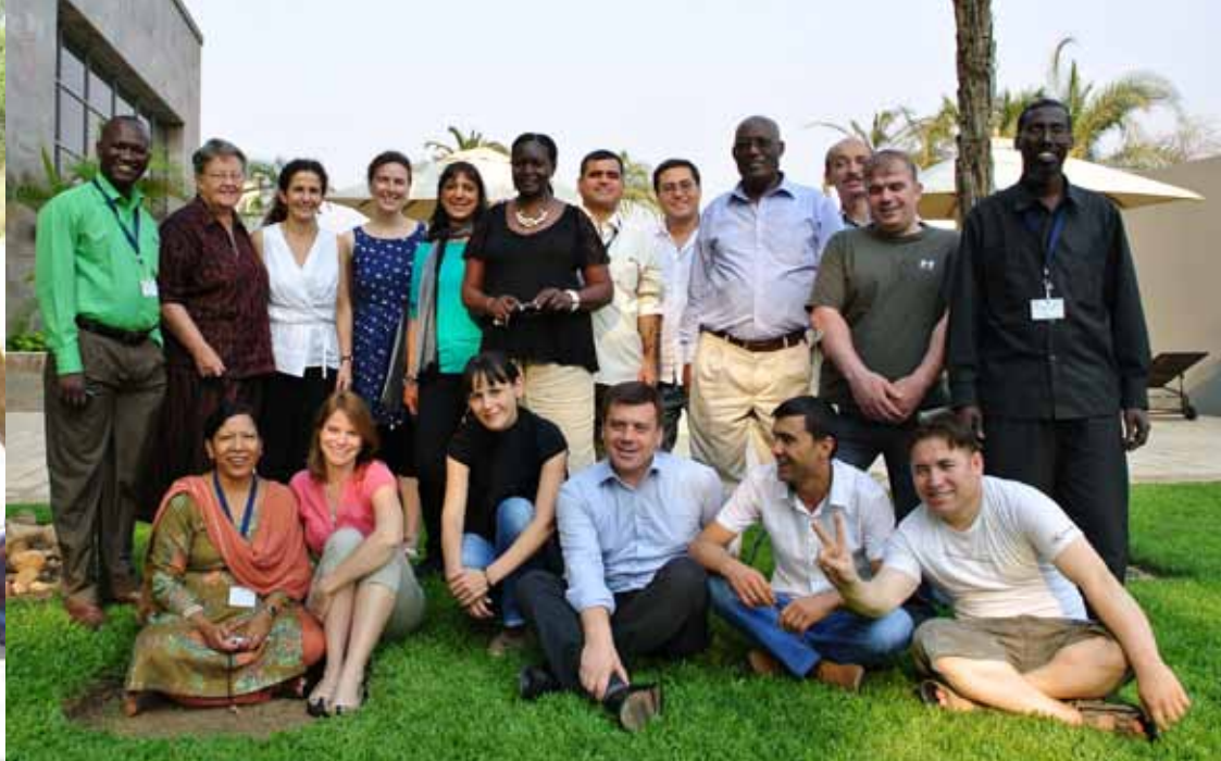
Representatives of survivor networks from around the world hone their skills at mobilizing resources.