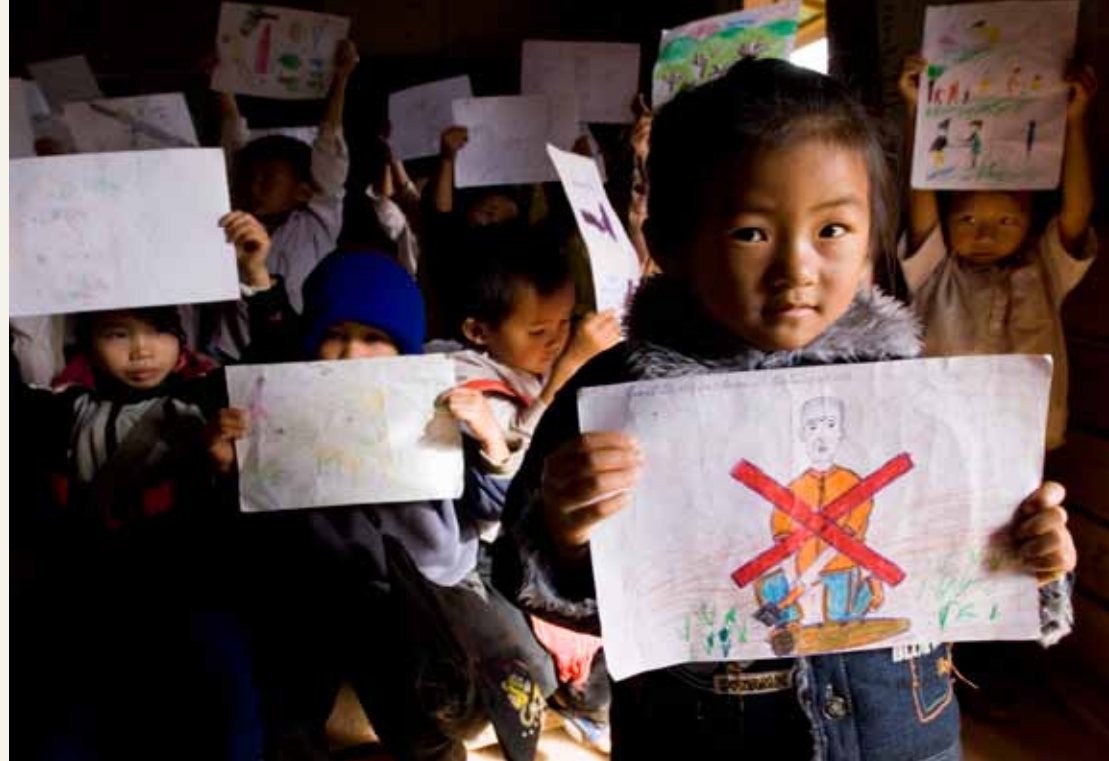
Children at Viengthong elementary school learning Mine Risk Education, Laos

Advocated directly with states and financial institutions through meetings and presentations, ensuring disinvestment was included in the African ratification template and providing up-to-date and accurate information.