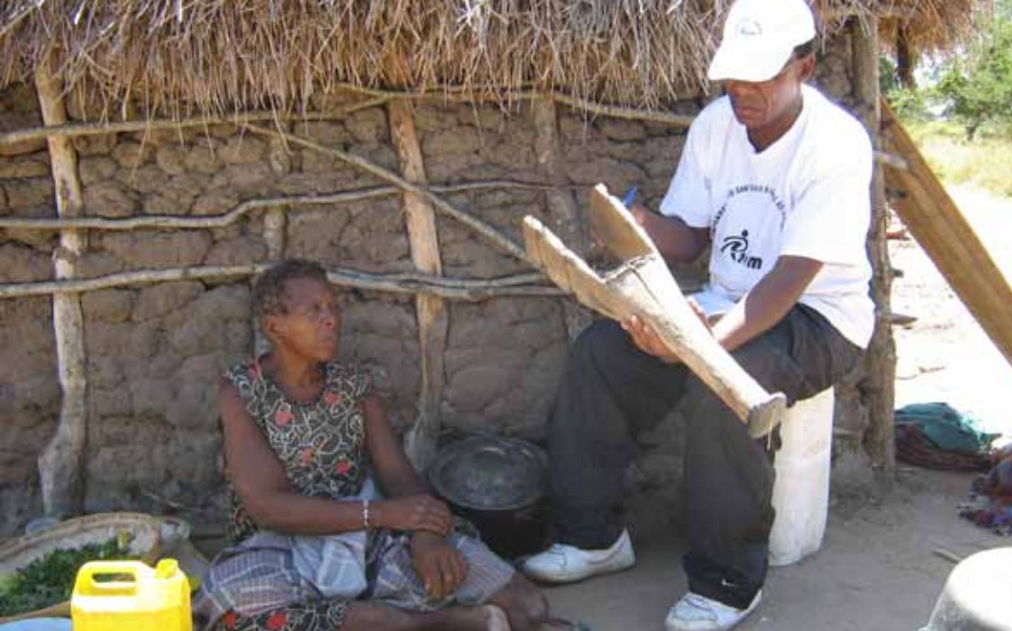
Director of the Mozambique Network of Survivors visits with a survivor and provides peer support.