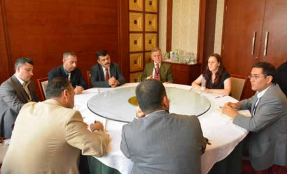
CMC Meeting with Iraq's Delegation. 4MSP Lusaka 2013