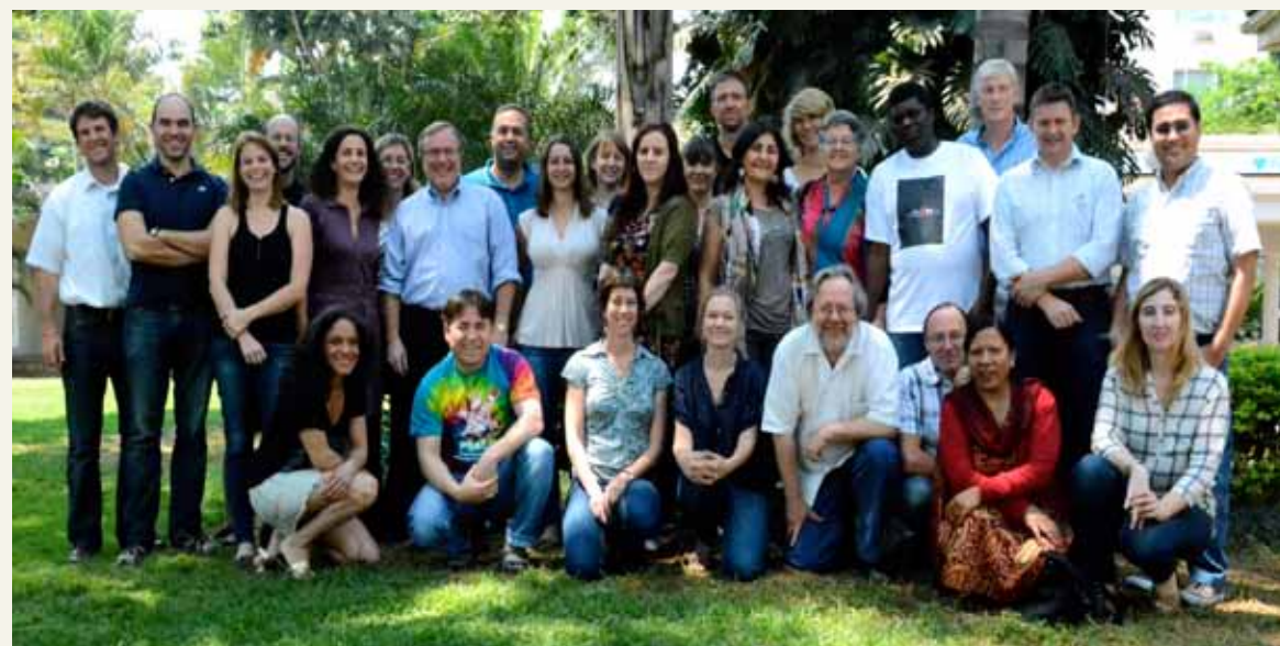
ICBL-CMC Governance Board and staff members after their meeting in Lusaka.

We do this through our four main projects: the International Campaign to Ban Landmines (ICBL), the Cluster Munition Coalition (CMC), the Landmine and Cluster Munition Monitor and the Survivors Network Project.