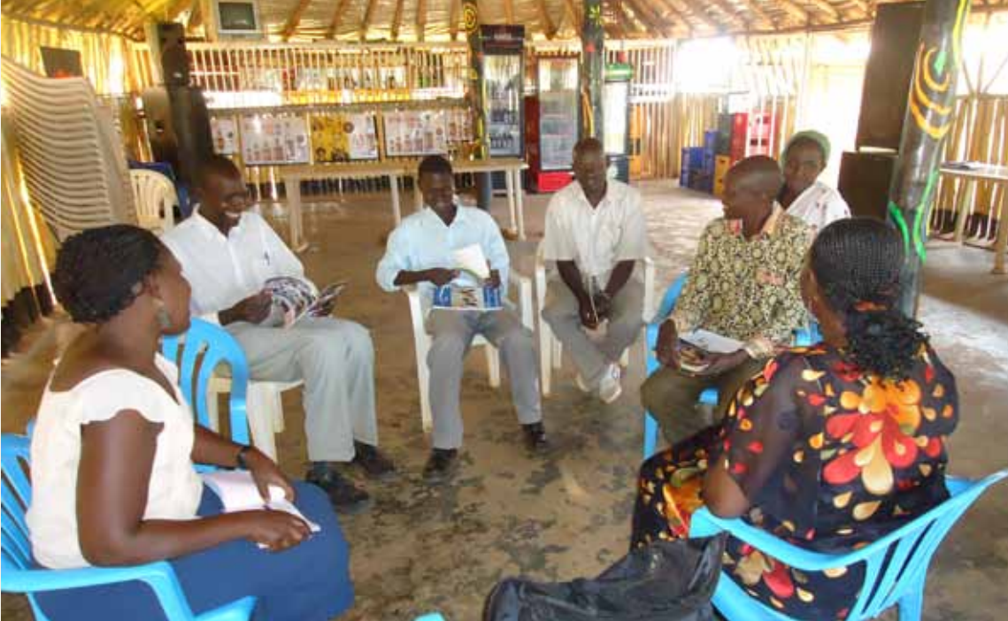
Staff of the Uganda Landmine Survivor Association meet with survivor leaders in northern Uganda, presenting materials on the rights of survivors.