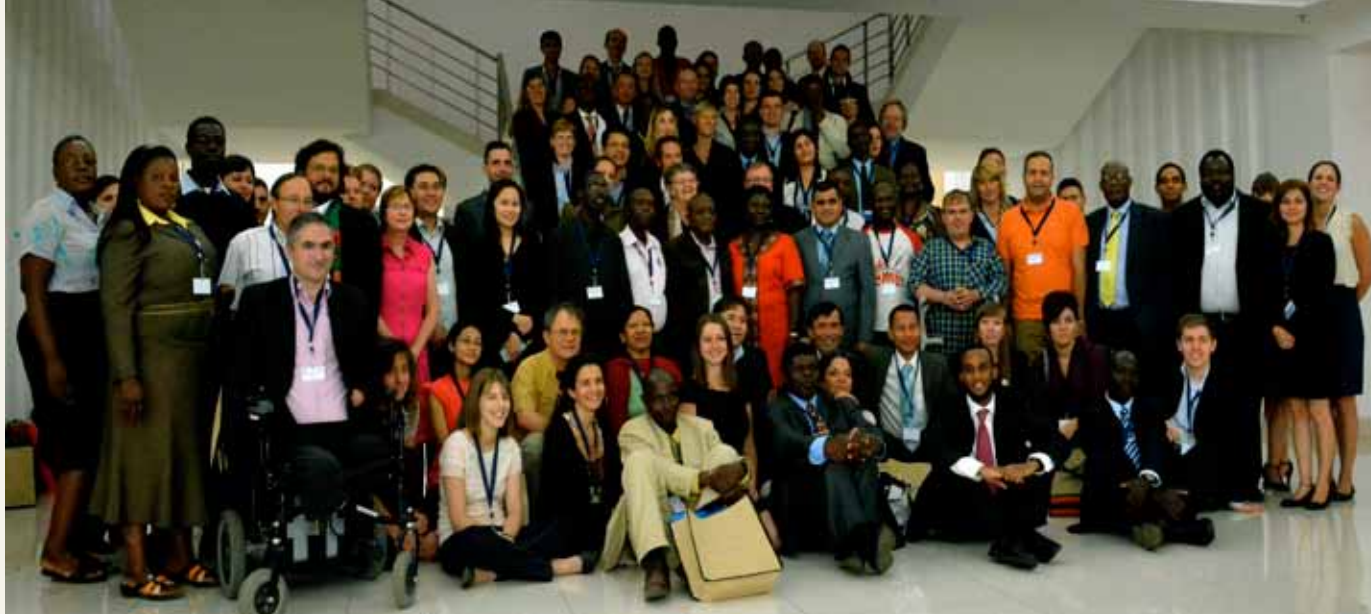
ICBL-CCM delegation at the 4th Meeting of the States Parties of the CCM, Lusaka, Zambia.

Advocacy with government policy-makers and decision-makers through meetings at regional and international conferences on the Mine Ban Treaty (MBT) and Convention on Cluster Munitions (CCM)