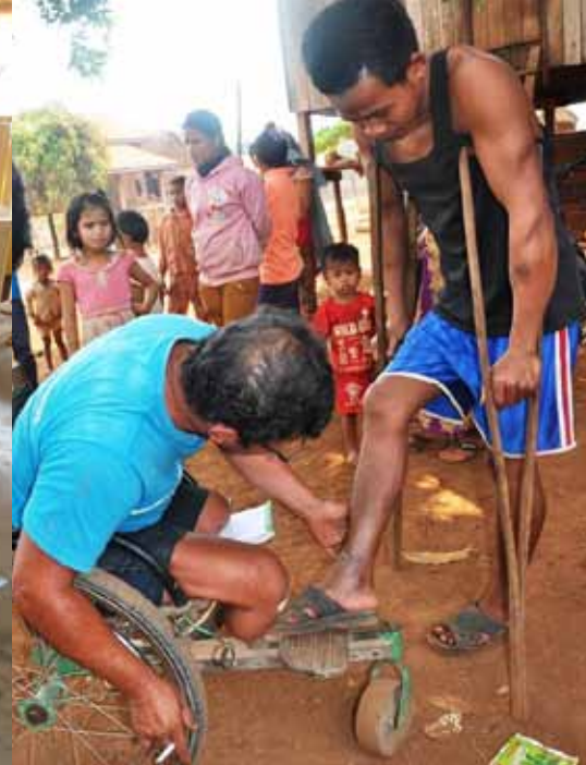
Survivor leader visits survivors in their communities.

with disabilities, reaching 26 women. In addition to the practical benefit of acquiring small business knowledge, the gender-specific trainings proved to be an ideal way to empower women survivors through group peer to peer interaction and support.