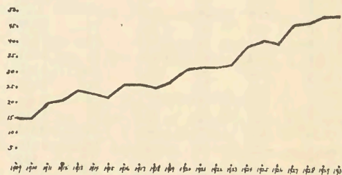
FIGURE I. GRAPH SHOWING, BY YEARS, THE NUMERICAL INCREASE IN FACULTY OF THE STATE TEACHERS COLLEGE AT HARRISONBURG (NOT INCLUDING SUMMER SCHOOL AND TRAINING SCHOOL)