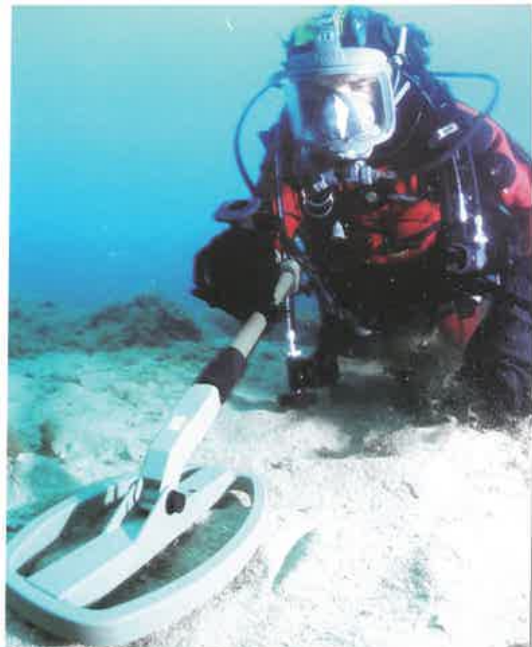
Training in underwater humanitarian demining in Bijela, SCG.

Ig 212 1292 Ig, Slovenia Tel: +386 1 479 6580 Fax: +386 1 479 6590 E-mail: marsic@itf-fund.si; hocivar@itf-fund.si