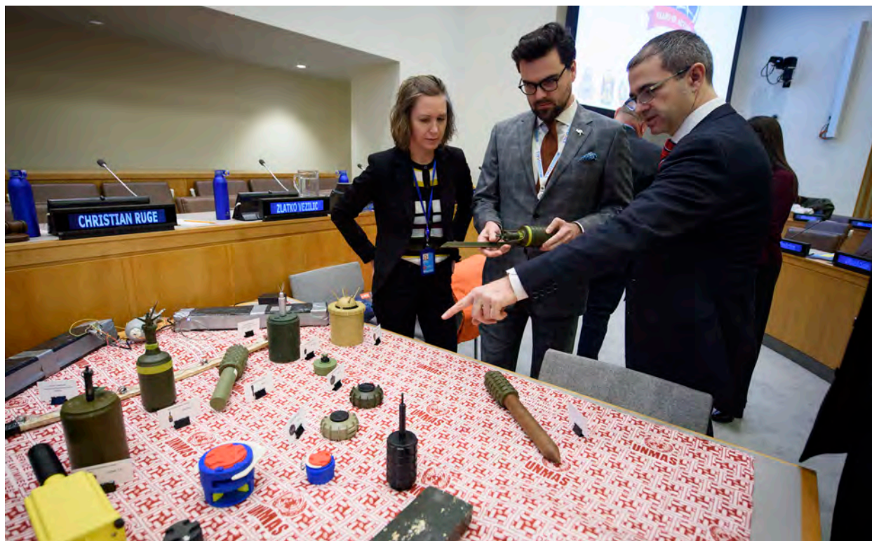
Delegates at UNMAS event "A World Free of Mines: For a Safer Tomorrow", 20th anniversary of the entry into force of the Mine Ban Treaty.

led by the respective presidencies. UNMAS also coordinated the contribution of IACG-MA to the Annual Meetings of the High Contracting Parties to the Convention, to Protocol V and to Amended Protocol II. Throughout 2019, UNMAS continued to leverage its role as the global coordinator for mine action to promote universalization of the Convention on Cluster Munitions, which entailed support to the Annual Meeting of States Parties to the Convention on Cluster Munitions, using its platform to express concerns over the alleged use of cluster munitions, and to reinforce the stigma surrounding their use. Moreover, promotion of the Convention on the Rights of Persons with Disabilities and the urgent need to do more and better for survivors of explosive ordnance were key messages relayed throughout UNMAS advocacy work in 2019. The commitment of UNMAS to prioritize Victim Assistance was reflected in the launch, in April 2019, of the Safe Ground campaign, a United Nations-led campaign to raise awareness about the impact of explosive ordnance on individuals and communities, and to