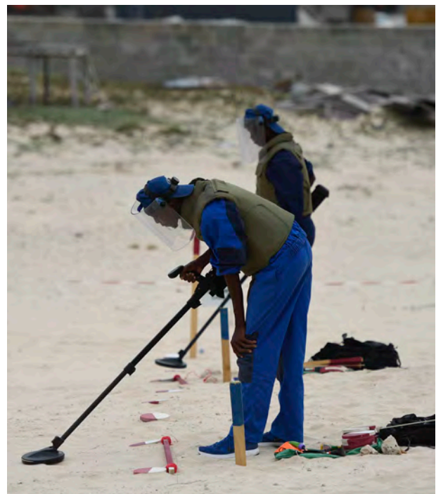
UNMAS trains locals from affected communities to identify and safely remove ERW in Somalia. UNMAS

for Sustainable Development at the national and local levels. In Iraq , UNMAS formed its first mixed-gender team of explosive ordnance searchers and ensured that survey and disposal activities led by partners benefited from gender-sensitive response training, thereby clearing land for use