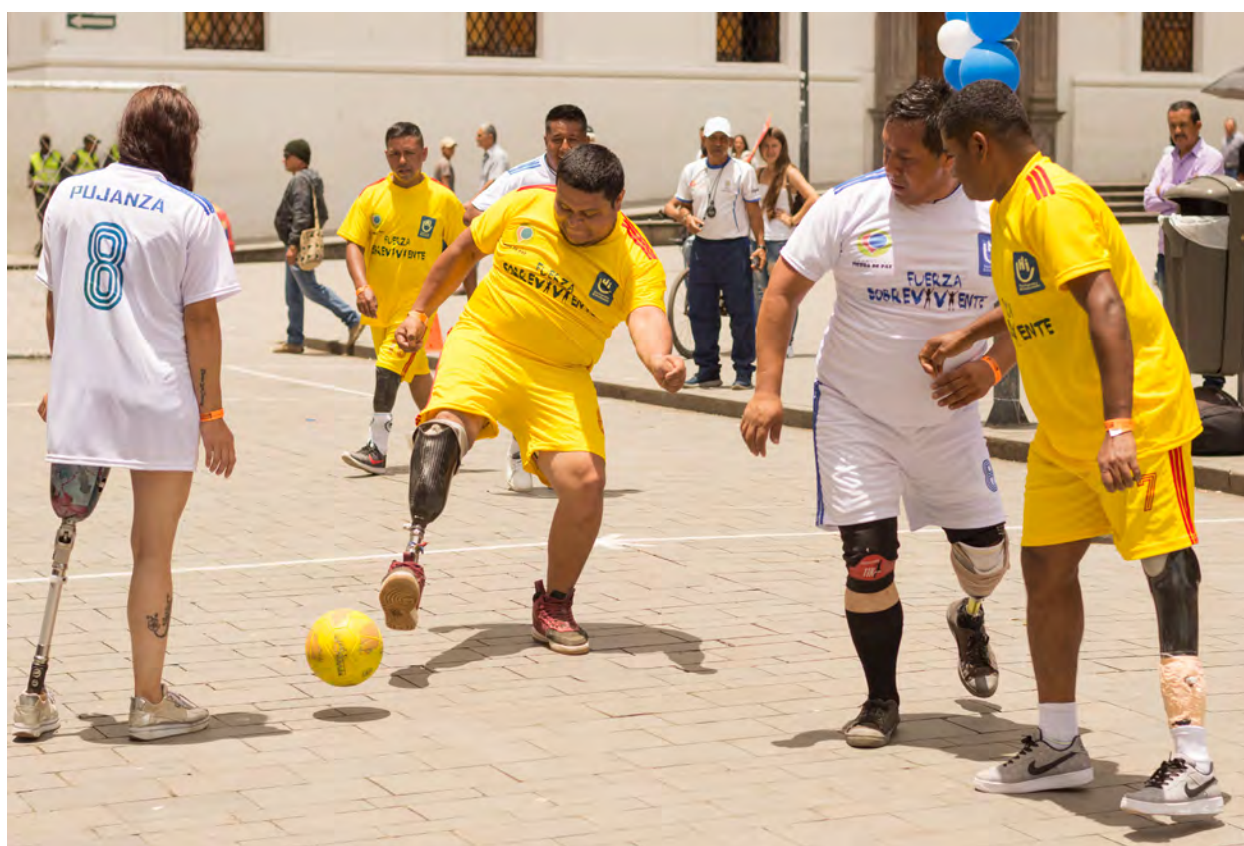
Civilian and military survivors play football in the main square of Popayan, Colombia, during the commemoration of International Mine Awareness Day. Angélica Collazos

stakeholders in the disability sector, including civil society actors, together in order to catalyse cooperation and increase the network of support available to the country's Directorate of Mine Action Coordination, while promoting the inclusion of persons with disabilities, for example through awareness-raising campaigns on the rights of persons with disabilities. Moreover, UNMAS assisted in the development of the first draft of Afghanistan's new Disability Strategy, which aims to ensure that the specific needs of women, girls, men and boys are considered by actors within the sector. In Libya , UNMAS coordinated a stakeholder analysis of victim assistance, bringing together national and international entities, survivors and persons with disabilities to inform the ongoing