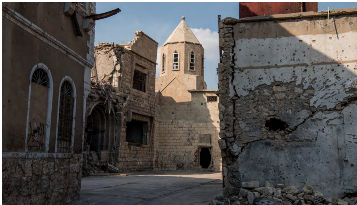
The Al Maedan District, West Mosul, is one of the most damaged and heavily contaminated areas in Iraq. The area is teeming with explosive hazards, in particular IEDs, left behind following the conflict.

by local communities in a way that mainstreams gender considerations.