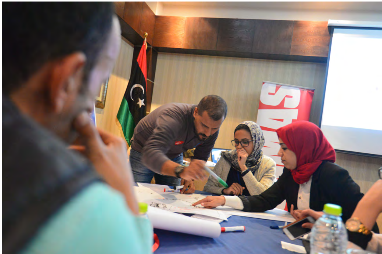
UNMAS convenes stakeholders in Tripoli to work on victim assistance responses. UNMAS Libya

Government. Training to the Ministry of the Interior encompassed explosive ordnance first response, EOD, IEDD, as well as courses on the use of drones in surveying and clearing land. For the first time, UNMAS delivered a series of mixed explosive hazard first-responder training courses to Iraqi police – an initiative that served to enhance skills in IED threat mitigation and response. Also, since the training was open to both women and men, it helped to create career opportunities for women in a male-dominated field. UNMAS advice and support in Nigeria propelled government-led efforts to establish a mine action strategy and develop national mine action standards. Training to Nigerian police and security forces, and civil defence personnel has also strengthened national capacity in the area of EOD and first response to explosive