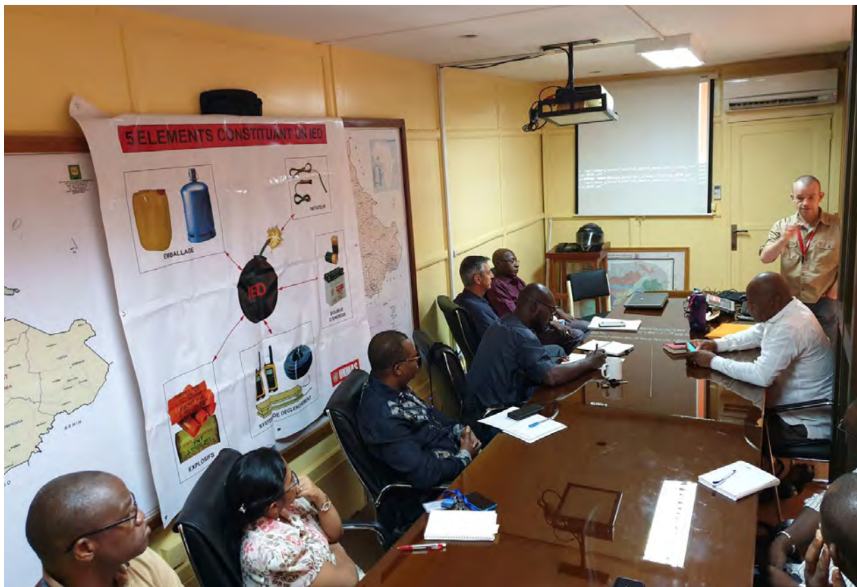
UNMAS trains members of the United Nations Country Team in Burkina Faso on IED risk mitigation.

The rapidly deteriorating security situation in Burkina Faso, involving persistent armed attacks in the northern and eastern regions of the country since 2016, has had serious humanitarian consequences. In September 2019, at the request of the United Nations Resident Coordinator, UNMAS deployed teams to Ouagadougou. With a clear escalation in the number of IED incidents in the past two years (an increase from one to 61 between 2016 and 2019), the country is facing a new threat that needs to be addressed. UNMAS projects fell under two areas of work: facilitating humanitarian responses, including through the sensitization of affected communities and humanitarian workers, and supporting national security forces in relation to explosive ordnance. During the first five months of its presence in the country, UNMAS conducted sensitization sessions for 249 humanitarian personnel (38 women and 211 men) in five regions; strengthened the protection sector, which contributed to improved integration of mine action into relevant humanitarian plans; and started working with the National Commission on the Fight Against Small Arms Proliferation to develop national standards for the coordination of risk education activities. also established working relationships with national actors, including the Ministry of Security, conducted sensitization sessions and delivered IED-response training and equipment to security forces and humanitarian personnel.