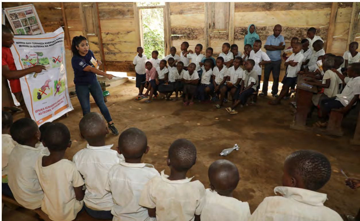
UNMAS provided risk education in a school in Mavivi, Beni district, Democratic Republic of the Congo.

Explosive ordnance risk education continued to be deeply embedded in UNMAS activities. Behaviour change messages and communication are tailored to specific audience groups, namely women, men, girls, boys and displaced or nomadic communities, among others. In Iraq , risk education took various formats in order to increase outreach, for example through billboards, TV clips, virtual reality goggles, branded products for United Nations implementing partners and targeted events, among others. UNMAS-coordinated explosive ordnance risk education in Nigeria specifically targeted internally displaced persons, host communities, refugees and returnees, which led to an increase in reporting of the presence of explosive ordnance. To improve the safety of families and individuals displaced at the onset of fighting in Tripoli, Libya , UNMAS