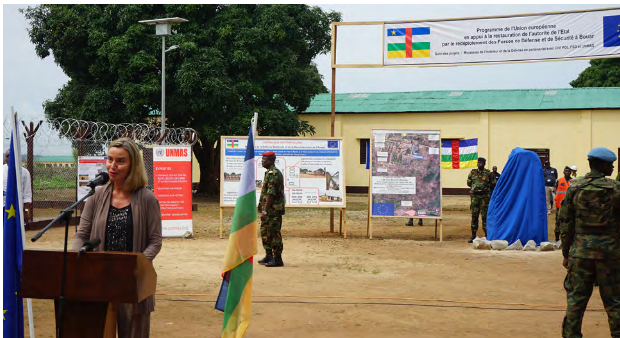
Federica Mogherini, European Union High Representative for Foreign Affairs and Security Policy, launches a European Union-funded mine action project in Bouar, Central African Republic – to construct and hand over specialized WAM infrastructure to national authorities.

The shift from predictable, sustainable, flexible and multiyear funding to earmarked contributions continues to impact the ability of UNMAS to deliver on all aspects of its mandate, respond to requests from Member States and United Nations senior management and backstop its programmes at Headquarters.