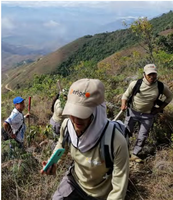
Non-technical survey teams identify and map hazardous areas in Colombia.

While capacity-building efforts must be led by the needs of respective countries, they must also be closely aligned with international frameworks, such as the Anti-Personnel Mine Ban Convention. UNMAS continues to support countries in their obligations under this and other international humanitarian law instruments. UNMAS is encouraged that Sudan will preside over the 18th Meeting of State Parties to the Convention, and will continue to support the country in this new responsibility in 2020. In 2019, UNMAS worked with the State of Palestine to ensure obligations under the Anti-Personnel Mine Ban Convention were met, including through assisting in the development of its second annual report, and in the compilation of statistics on mine clearance activities in the West Bank. The work of in assisting States with aligning their efforts to international norms is not only good for the standing of national governments on the international stage; but it also impacts the safety, quality and responsiveness of mine action on the ground, leading to benefits for affected communities.