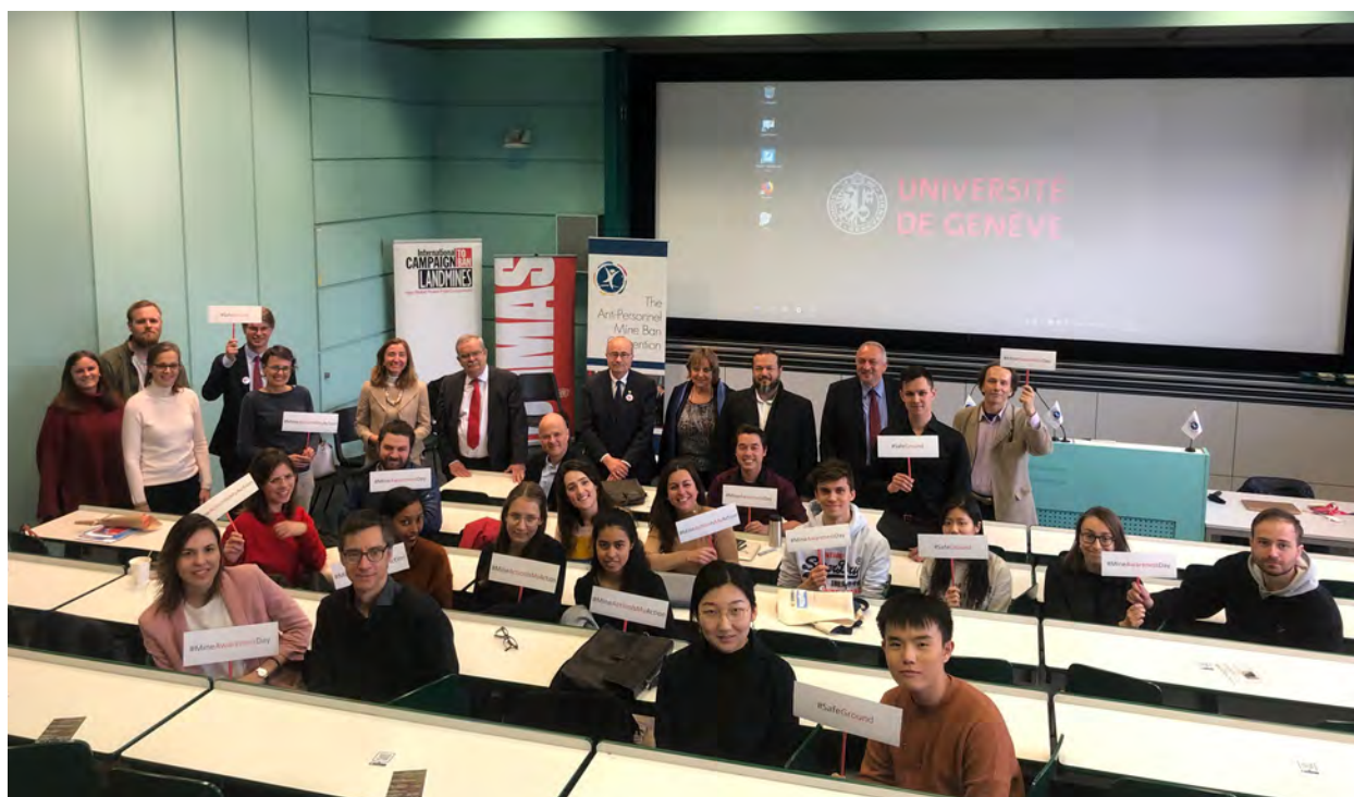
Participants and speakers at an interactive panel discussion at University of Geneva on the International Day for Mine Awareness and Assistance in Mine Action, April 2019.

UNMAS actively engaged in the Group of Experts meetings on Protocol V on Explosive Remnants of War and on Amended Protocol II on Mines, Booby-Traps and Other Devices to the Convention on Certain Conventional Weapons, supporting the technical discussion and universalization efforts