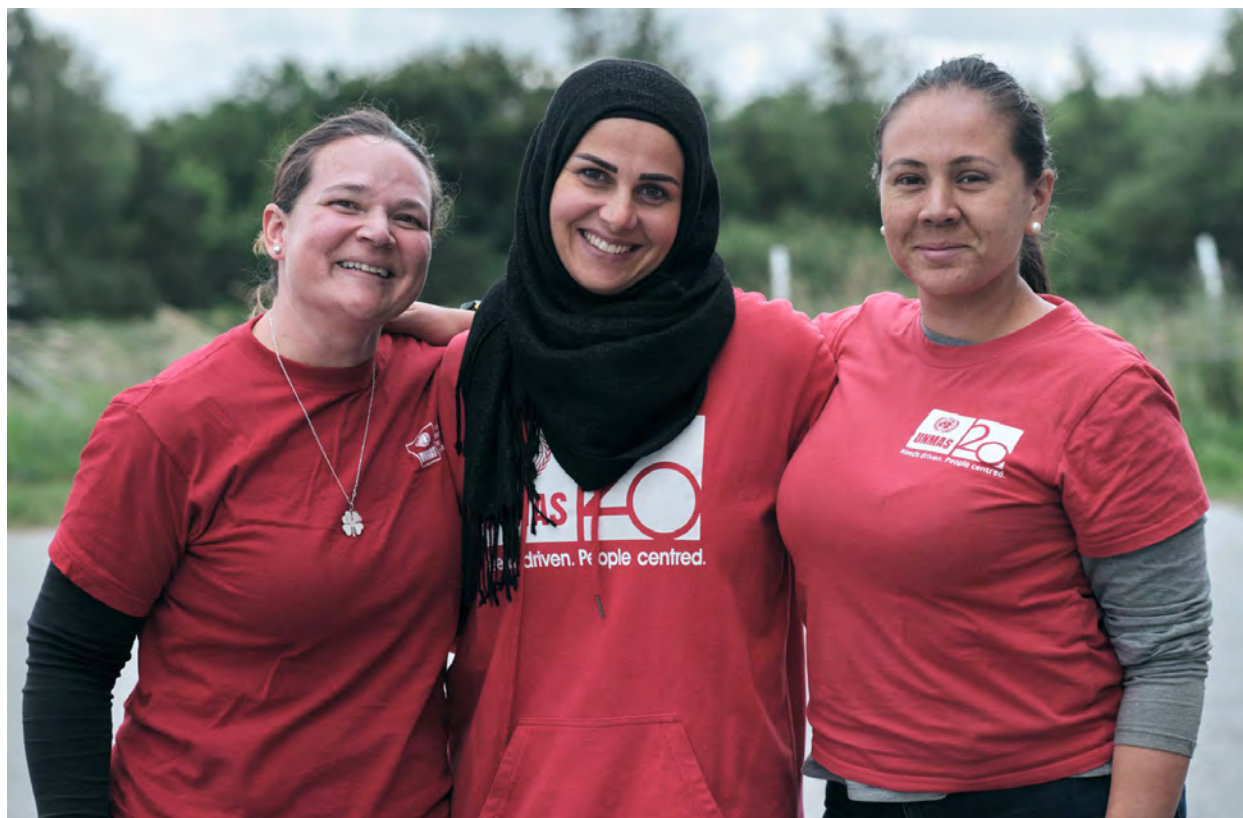
UNMAS officers celebrate the successful completion of EOD Level 3 training in Denmark.

and technical training to the only female demining team in Afghanistan . In April 2019, the team started its second clearance project in Bamyán and released an additional 61,344 square metres of land, thereby contributing to making Bamyán the first province to be declared free of all known minefields. Beyond the provision of immediate life-saving assistance, the women set an example through their meaningful and impactful participation in mine action, and have served to demonstrate alternative livelihood pathways for women in Afghanistan. In Iraq , the very first mixed team of searchers was established by UNMAS in Sinjar. Emblematic of the role of mine action in dismantling gender and other social barriers,