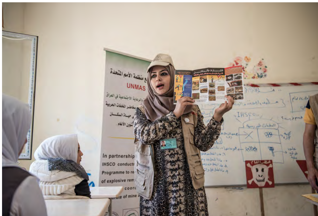
UNMAS partners provide risk education on explosive hazards at a school in Mosul, Iraq.