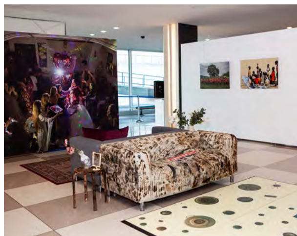
“Safe Ground” exhibit at UNHQ, New York, showcasing UNMAS work in facilitating the return of civilians to their homes following conflict.

educated on the ways in which those threats can be mitigated. In Geneva, UNMAS took the International Day to the wider public with the screening of a short trailer at six independent cinemas to increase awareness of the impact of explosive ordnance on civilians. A video explaining the importance of mine action was also displayed on screens at Geneva Airport. An interactive panel discussion at the University of Geneva explored the linkages between mine action activities and the goals and priorities laid out in the Secretary-General’s Agenda for Disarmament and the global 2030 Agenda for Sustainable Development.