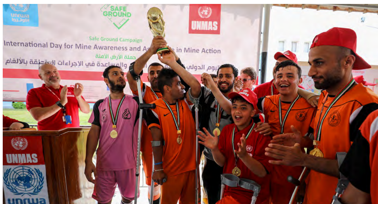
Participants in the football tournament organized by UNMAS and the Palestine Amputee Football Association, as part of the Safe Ground campaign, International Day for Mine Awareness and Assistance in Mine Action, April 2019. UNMAS Palestine

In Colombia, a university panel discussion brought together academics, United Nations actors and civil society representatives to discuss the complex needs of survivors of explosive incidents and the challenges in promoting survivors' rights. Some of the interactive initiatives organized in Iraq included photo exhibitions, documentary screenings, risk education theatrical plays, and "safe runs" around camps for internally displaced persons.