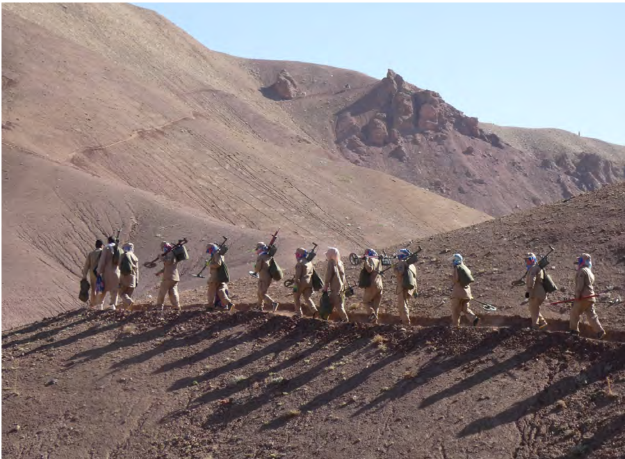
Afghan female deminers in Bamyan Province, Afghanistan. UNMAS

Consideration of diverse and at-risk groups further influenced UNMAS risk education