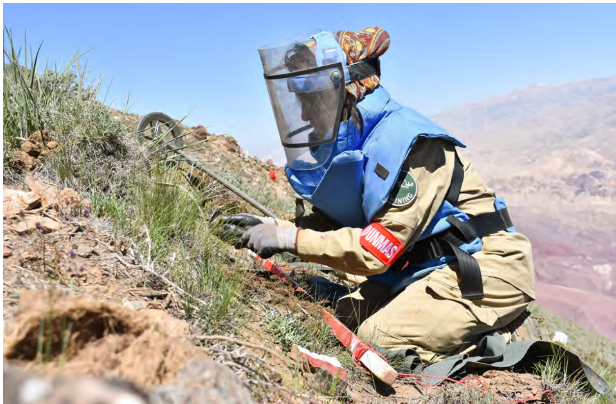
One of the first female deminers in Afghanistan clears mines in Bamyan Province, Afghanistan. DDG

casualties. UNMAS also focused on mitigating the risks posed by poorly secured/managed explosive materiel. As in previous years, that work was complemented by efforts to strengthen mine action coordination among United Nations, national and international partners, and to develop the capacity of local and national actors, pursuing the goal of phasing out United Nations assistance. In 2019, UNMAS continued its work in Afghanistan, Colombia, Democratic Republic of the Congo, Iraq, Libya, Mali, Nigeria, State of Palestine, Somalia, South Sudan, Sudan, Syrian