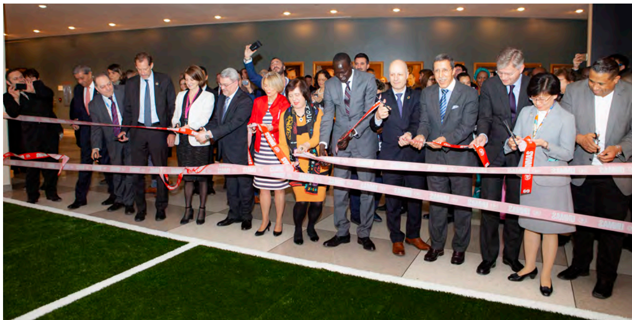
Member States delegates and United Nations officials open the “Safe Ground” exhibit at UNHQ, New York, 4 April 2019.

Ground, which aims to turn minefields into playing fields. The Secretary-General launched the five-year campaign to raise awareness and resources for victims and survivors of armed conflict. The campaign complements the United Nations Mine Action Strategy 2019-2023, and specifically supports its Strategic Outcome 2 on caring for survivors of explosive accidents and their families. The Safe Ground campaign will leverage partnerships with Member States, donors, civil society, sports federations and the private sector.