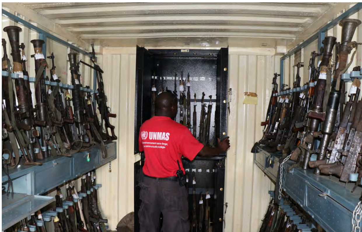
UNMAS creates safe gun solutions for national security forces in Goma, North Kivu, Democratic Republic of the Congo.

In Libya , UNMAS strengthened the capacity of national authorities to respond to and mitigate the increasingly complex threat of IEDs. A crucial part of that intervention involved training Libyan Forensic Police to respond to IED incidents, including with regard to the management of hazard scenes and the correct handling of evidence and explosive remnants, which has assisted in judicial prosecution and, in turn, strengthened the rule of law and helped