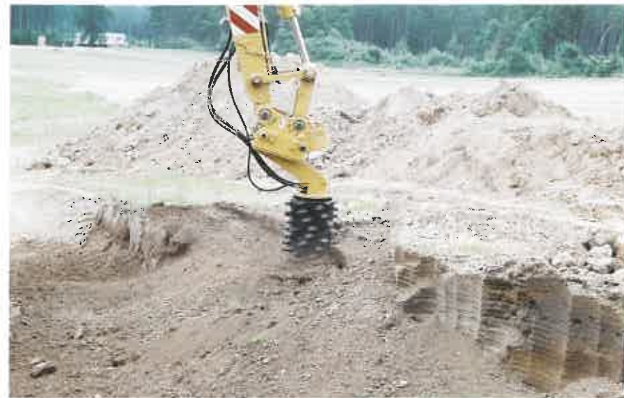
Shaving contaminated wall with vertical mill.