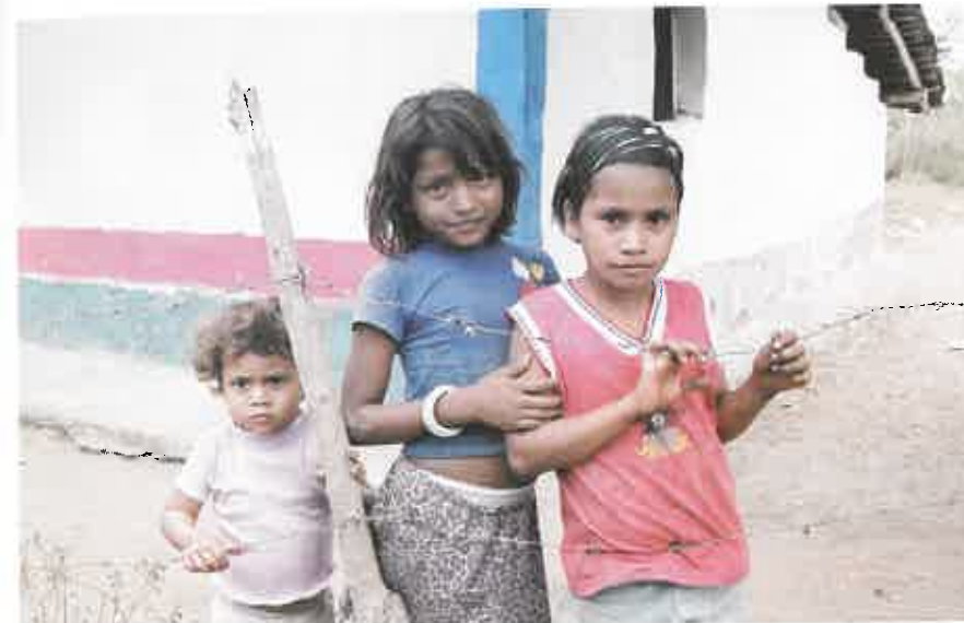
Children of Las Canoas greeted the HD training team each afternoon.

NVESD designed, fabricated and tested the equipment over a six-month period in 2003; the equipment sailed for Port Cortez in October; and formal training of the Honduran operators began on-site in December. Training was completed in January, and with much ceremony and optimism, the equipment was formally turned over to the Honduran army for use. The Sifting Excavator was employed in minefield clearance operations steadily between February and June 2004 under the supervision of MARMINCA observers. The originally conceived process was used in tandem with a manual demining team. Testing had shown the equipment effective in removing randomly laid mines to a depth of 50 centimeters with 99.38 percent efficiency when employed alone. In conjunction with manual checks of the area using detectors, the test efficiency was