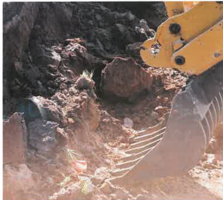
Wall collapses revealing AT mine.

When mine clearance operations closed down on June 12, 2004, for the last time in Honduras, U.S. Army Night Vision and Electronic Sensors Directorate (NVEDS) prototype equipment on trial was there to help complete the work started nearly one decade ago. Progress in reaching this milestone had stalled in 2002. Lack of a solution to a troublesome combination of environmental and threat factors remained beyond the capability of normal clearance procedures at one of the last remaining mine-suspected areas left in Honduras. Conventional clearance methods had revealed evidence of a mixture of anti-personnel and anti-tank mines buried under a meter of highly mineralized sediments. The Honduran deminers and the Organization of American States (OAS) project sponsors contacted the U.S. Humanitarian Demining (HD) Research and Development (R&D) Team for assistance in clearing these deeply buried mines, which were undetectable and unreachable by ordinary means. To meet this challenge, engineers from the HD team devised a two-step mechanical process based on a specially adapted, multi-