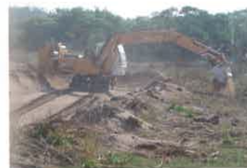
Minefield operations at Las Canoas.

perfect. The manual deminers perform frequent checks of the excavator's area of operations and inspection of the residual materials that are produced in the sifting operations. Operation in areas previously cleared to 20 centimeters was modified from the originally conceived process to use the machine for digging "sampling trenches." Digging/ clearing efficiency with the excavator is not as high with the sampling technique, but overall process efficiency is improved because each sampled unit of area represents a larger parcel.