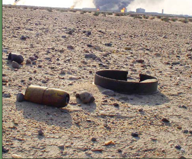
Figure 6. Inspection of BETAB-500 concrete-piercing aerial bombs. It is important such items are reported into databases in detail and not just as abandoned unexploded ordnance (AXO) or worse, misidentified as unexploded ordnance (UXO).

Figure 5. A BLU-97 submunition, Iraq. Correctly identifying the ordnance model is an example of basic data collection required to enable meaningful KPIs to analyze field operations. Reporting items simply as “UXOs” into databases is so general as to be meaningless or worse misleading.