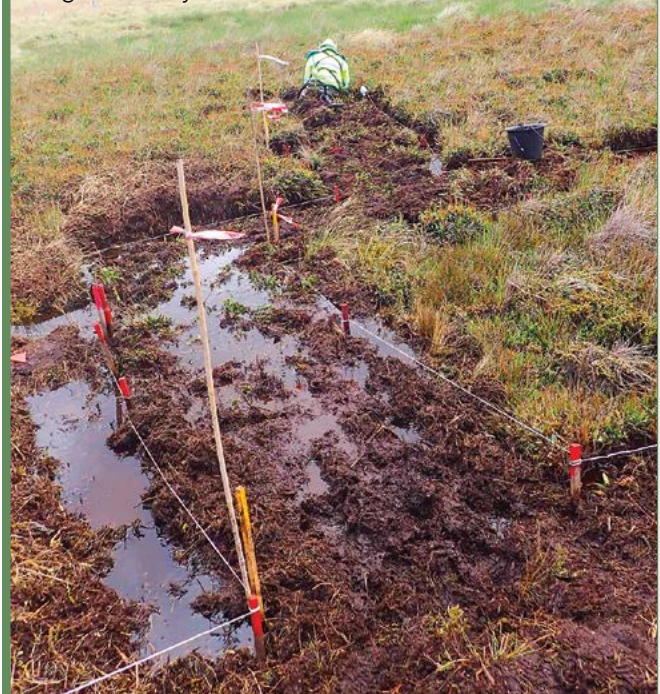
Figure 2. Demining in saturated ground in the Falkland Islands. Capturing Context at the Point of Data Entry is difficult to do effectively. This TNMA suggests 17 basic context capture questions with the demining site/polygon being the unit for which context is recorded.

Agreement on this proved elusive. The imperfect compromise that resulted was just to capture as much context as practical with simple Yes or No questions. The TNMA details seventeen context capture questions that may be used by operators. The unit of measurement is the site or polygon as recorded in a task order or clearance plan. Where conditions vary significantly within a given site, the operator may consider splitting the site for reporting purposes. Given that conditions change as a site is processed, the point of context capture should be the first day of Technical Survey (TS) or Clearance.