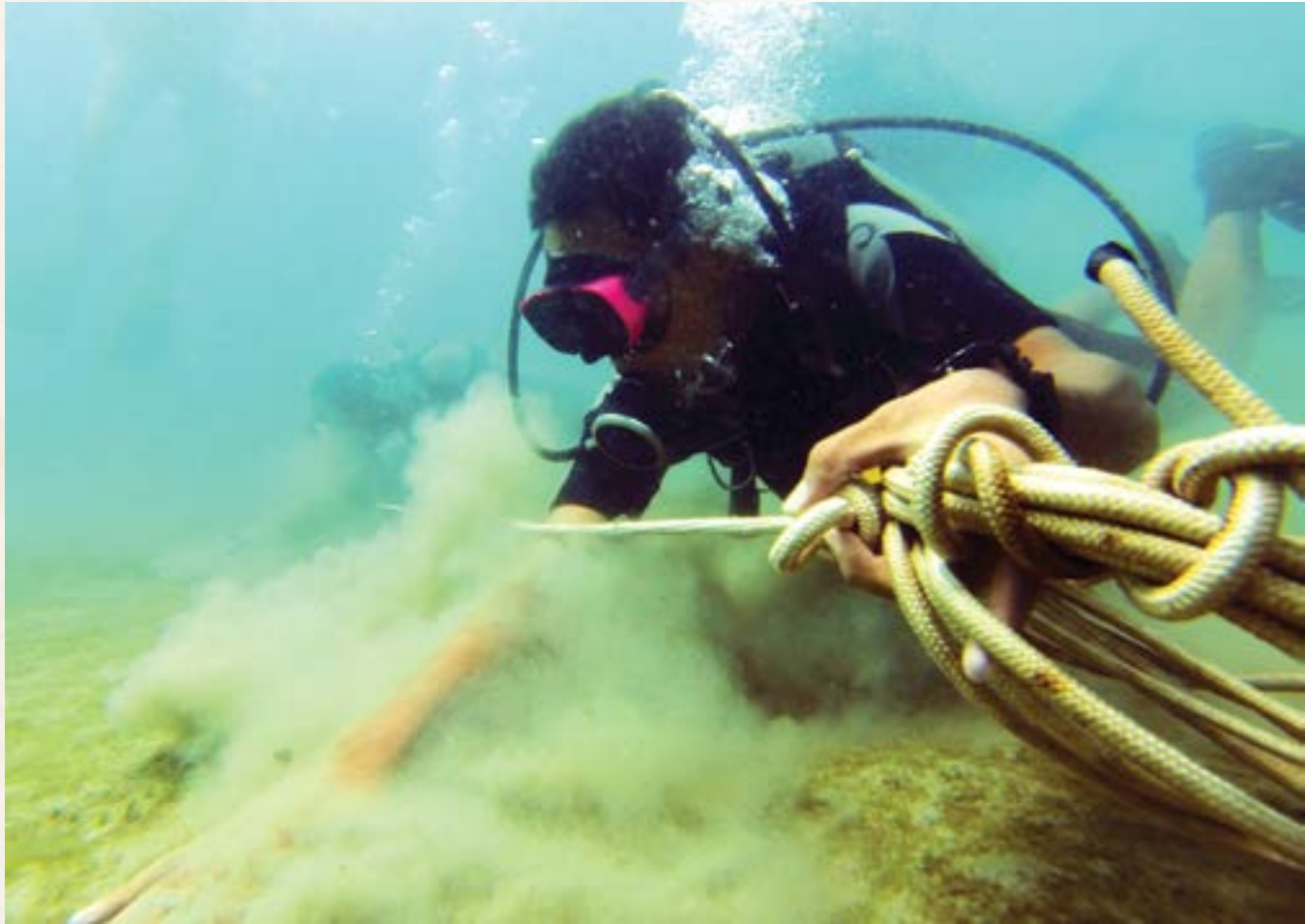
Wearing blackout masks that completely obstruct their vision, students perform a circle-line search, simulating the type of work they will do in Mekong, Cambodia.