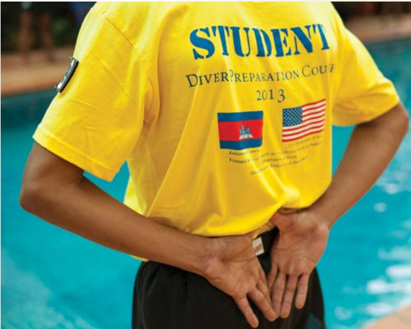
The discipline and attention to detail divers learn is critical to operational safety.

these river convoys were a lifeline that supported Phnom Penh from 1973, when insurgent forces cut off the city, until the capture of Phnom Penh in 1975. 2