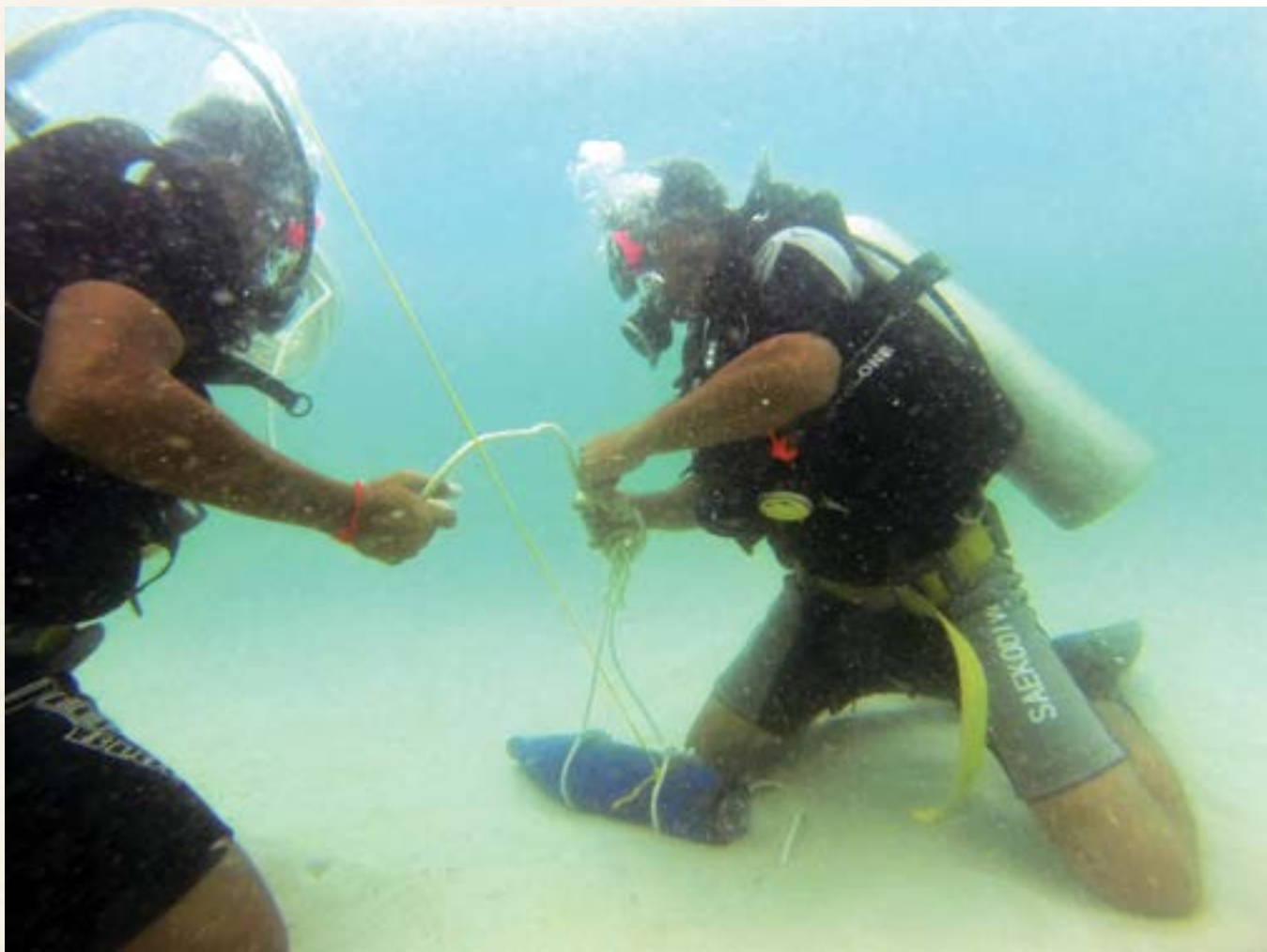
Wearing blackout masks, students rig training ordnance for recovery, tying knots using only their sense of touch.

theoretically possible due to the visible footprint that even makeshift dive operations present, the lack of police manpower, cost and other challenges in implementation make this approach untenable. Full recovery is the best solution.