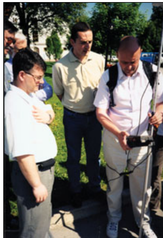
Applied technology was a key aspect for users at the GIS workshop.